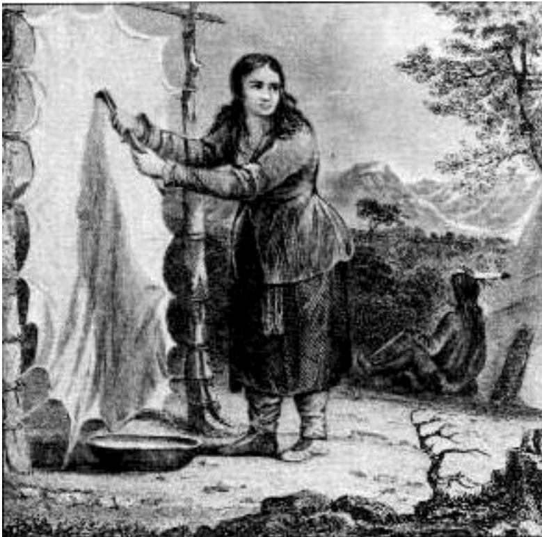
A woman dressing a buffalo hide.

The work of men was hunting and warfare. Men hunted buffalo, deer, bear, elk, and smaller animals. Sometimes they would chase the buffalo into an ambush and kill many that way. Sometimes they would light the prairie on fire and confuse the animals so they could kill them easier. Hunting buffalo was dangerous work. The bow and arrow and war club were the traditional weapons of the Illini. Guns were not used until Europeans made them available. The Illini often used guns to frighten enemies that has never seen them before.