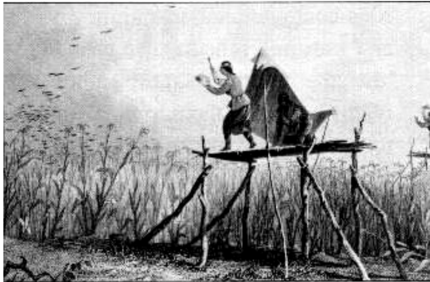
Women guarding corn from birds.

In the summer the Illini wore little clothing. Men and women tattooed their bodies when they became 25 years old. It was a sign of accomplishment. In the winter they wore robes made from buffalo hides.