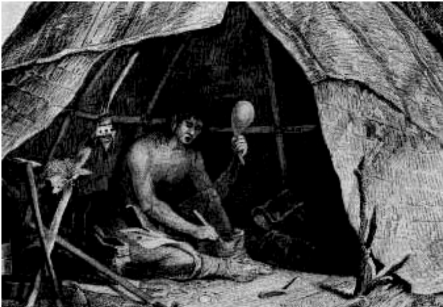
A shaman mixing medicine.

Exchanging gifts was an important part of the Illini marriage ceremony. When a person died the grave was filled with items needed in the afterlife. Tobacco, bow and arrow, kettle, and corn were some of the gifts that were buried alongside the body. Men's faces were painted red. Dances of mourning were held. The family gave presents to the dancers.