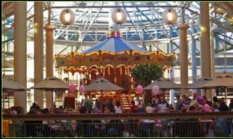
Danbury Fair Mall, CT