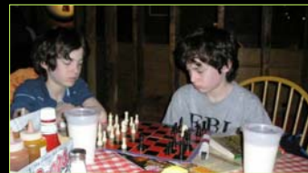
Famous Dave's Restaurant, Champaign, IL 2004