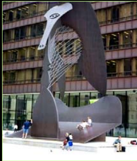
Chicago, IL