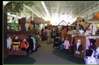
Great accessible interior Geneva