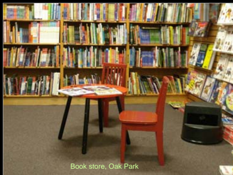
Book store, Oak Park