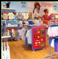
From: Child Friendly Solutions, Australia