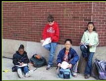
Photo: Architeacher in Downtown Champaign, IL 2008 (Architeacher.org)