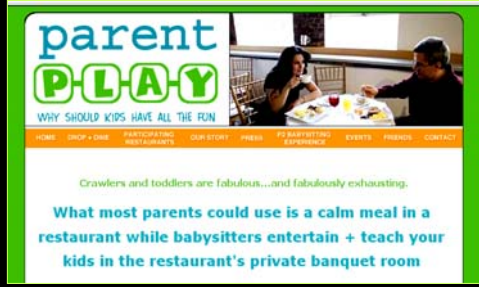
In NYC. Website of www.ParentPlay.com