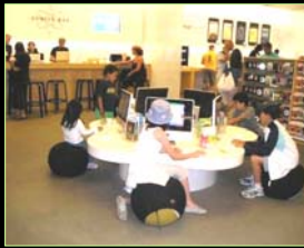
Apple knows how to do it