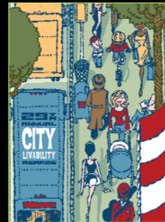
29th Annual Livability Awards