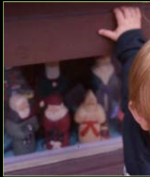
Vermont Storefront.