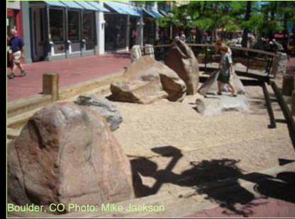
Boulder, CO