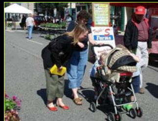
Farmer's Market, Springfield, 2006