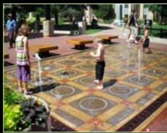
Boulder, CO