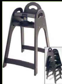
Koala Kare Products