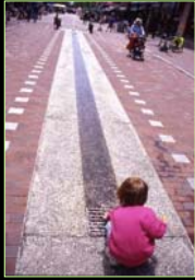
Burlington, VT