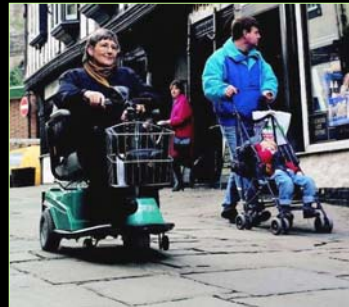
From: Partners in Shrewsbury