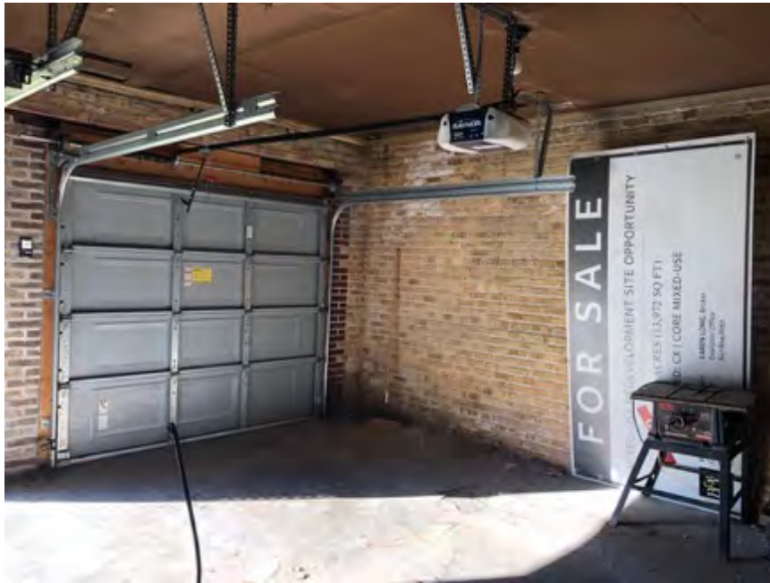
Garage interior, looking northwest