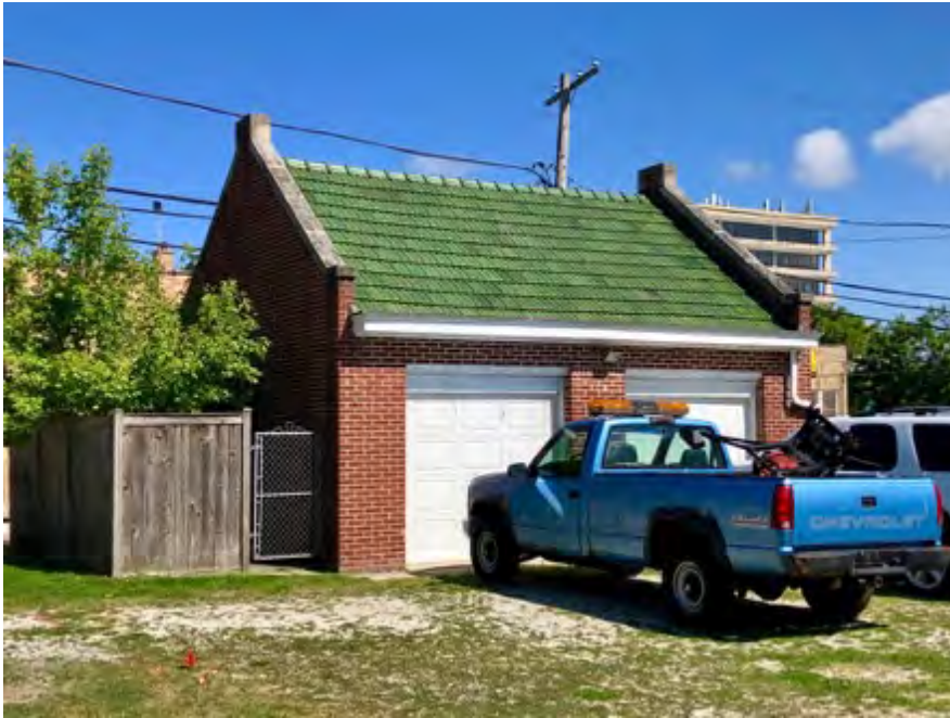
Garage, looking southeast