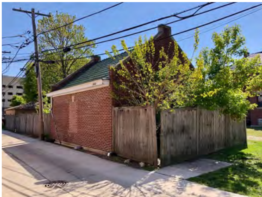
Garage, looking southwest from alley showing bricked-in east window