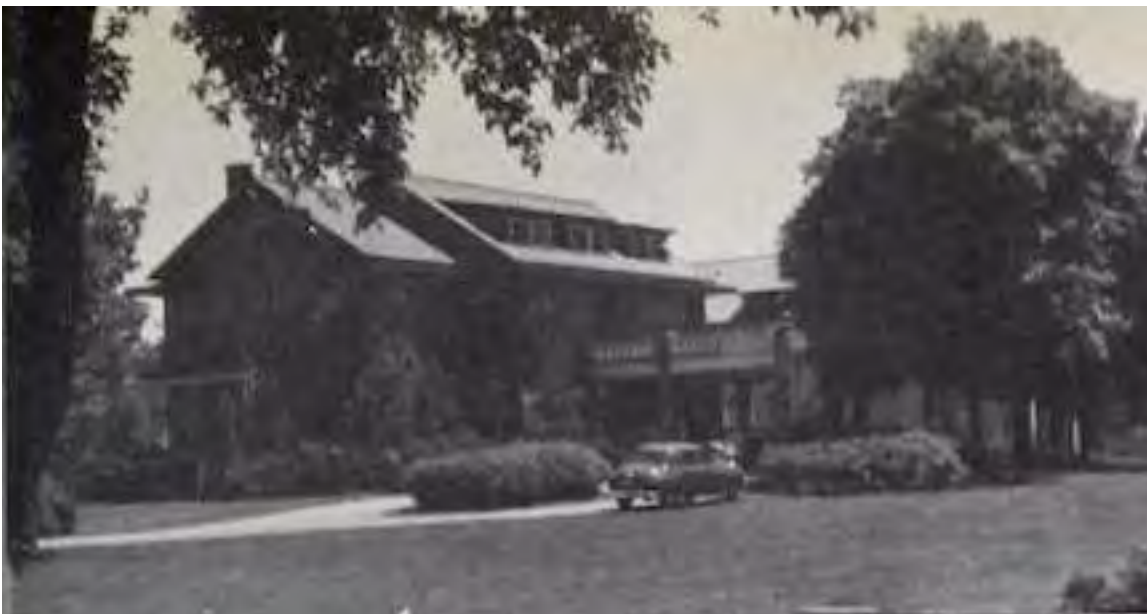
Same view, 1950