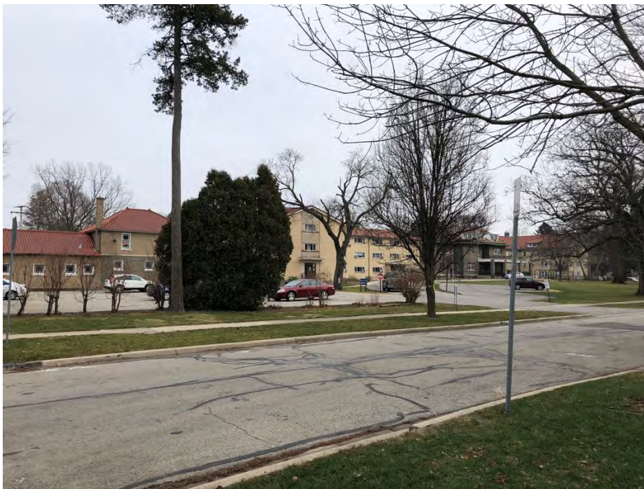
Wide view to southeast, showing Kroehler Coach House at left