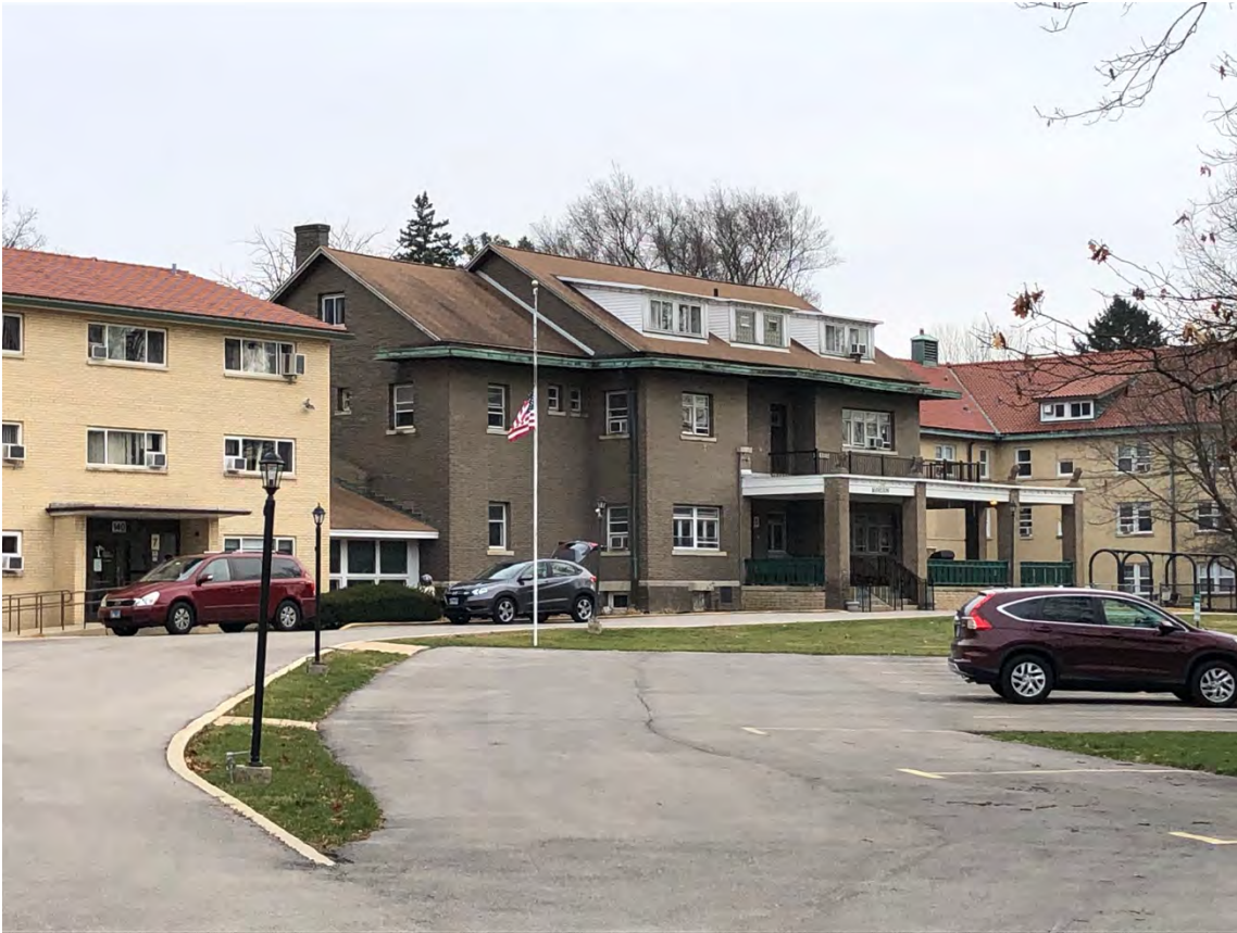
Detail view to southeast