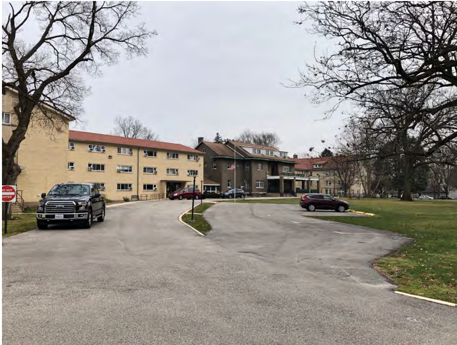
View to southeast, showing l. to r. Kroehler Hall North, Kroehler residence, Kroehler Hall South