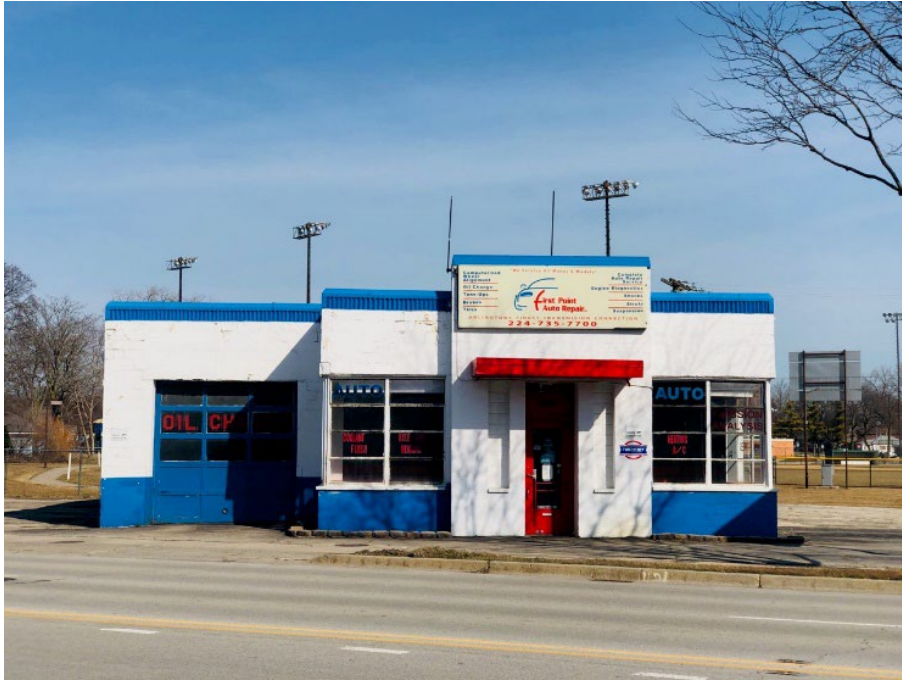
500 E. Northwest Hwy. 1 st Point Auto Repair

Photo documentation: 500 E. Northwest Hwy, Arlington Hts., IL 60004