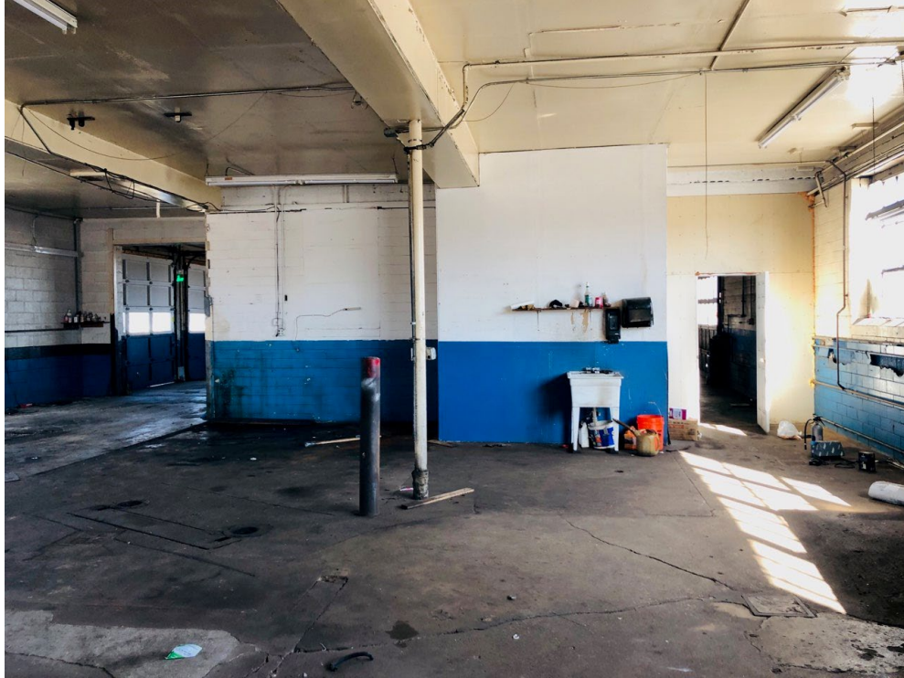
Repair Bay Area #2- East side of building

Photo documentation: 500 E. Northwest Hwy, Arlington Hts., IL 60004