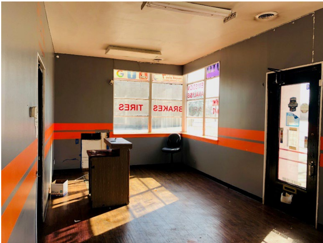
Customer Care Front Desk view 1 of 2