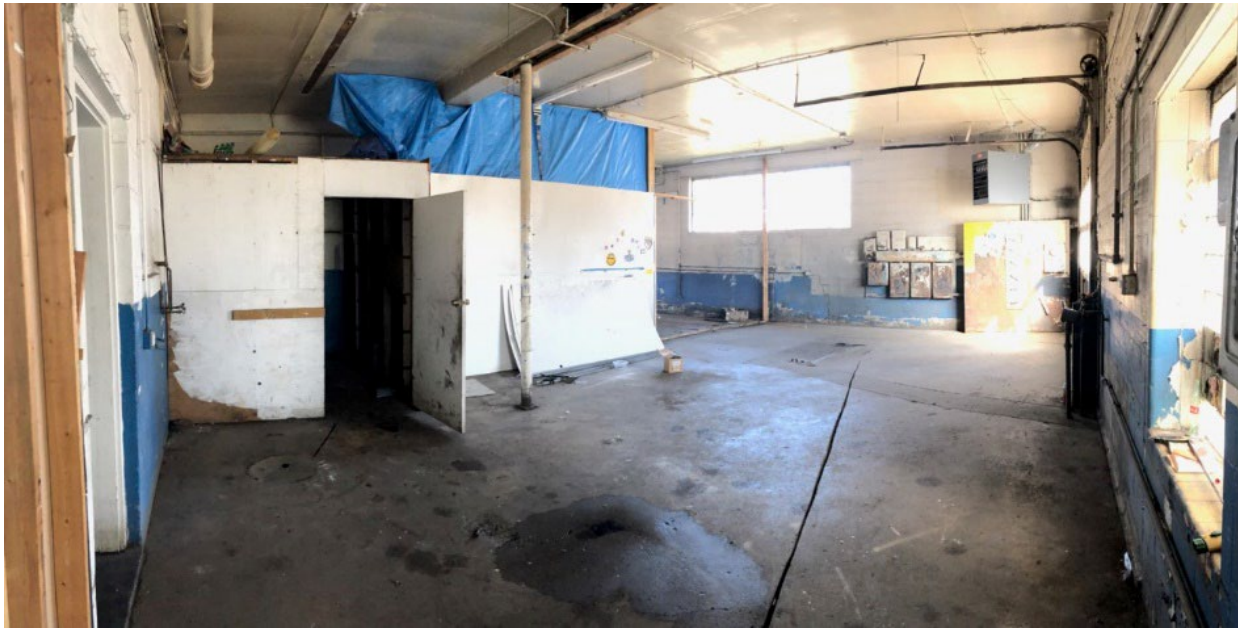
Back Bay Area #2 and supply closet

Photo documentation: 500 E. Northwest Hwy, Arlington Hts., IL 60004