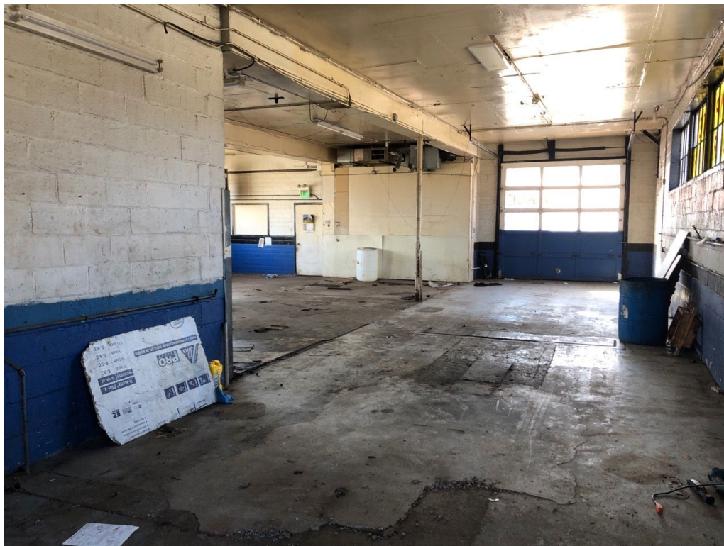
Repair Bay #1 West side of building View looking north