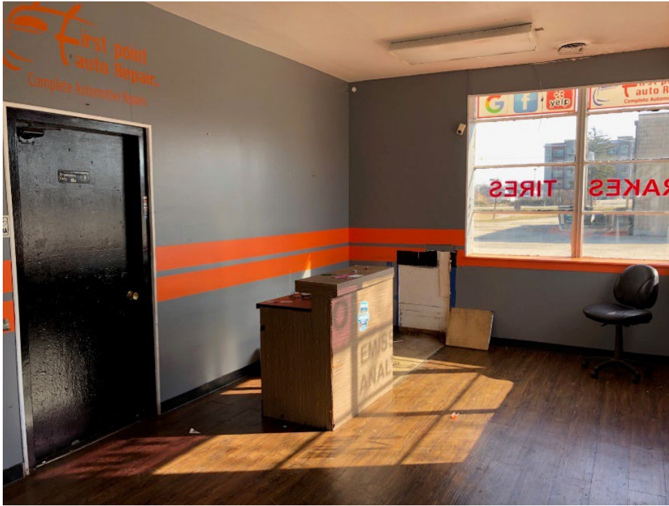
Customer Care Front Desk view 2 of 2

Photo documentation: 500 E. Northwest Hwy, Arlington Hts., IL 60004