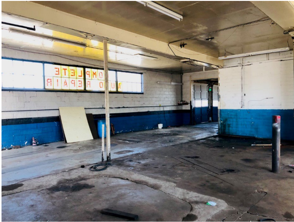
Repair Bay #1 West side of building View looking south

Photo documentation: 500 E. Northwest Hwy, Arlington Hts., IL 60004