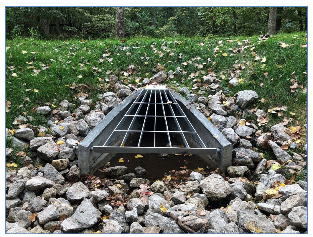
North Side Flared End Section