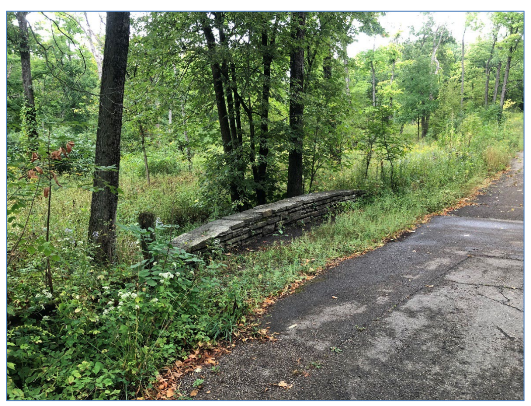
Future Location of Interpretive Sign