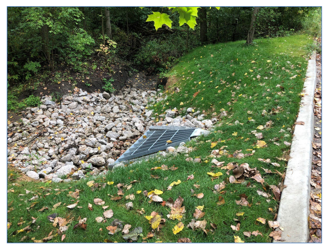
North Side Flared End Section