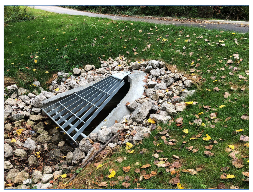
South Side Flared End Section