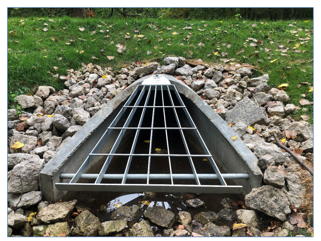
South Side Flared End Section