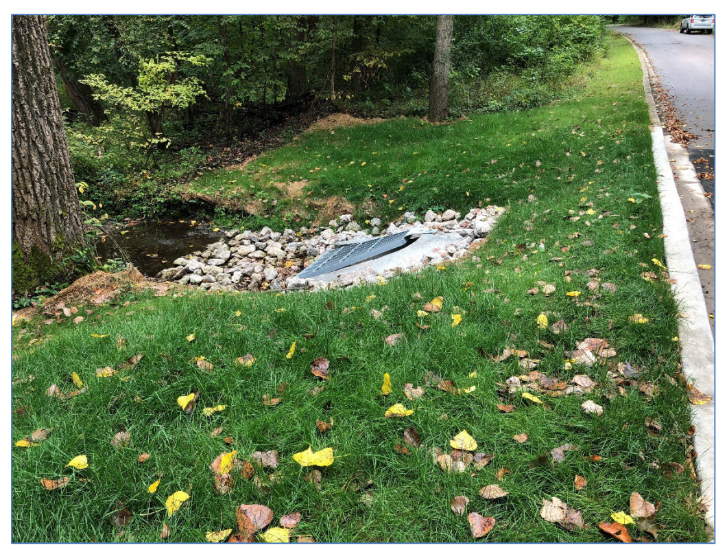
South Side Flared End Section