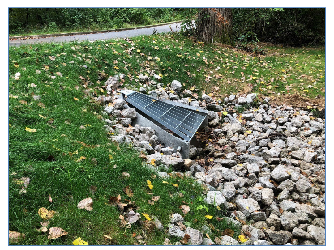
North Side Flared End Section