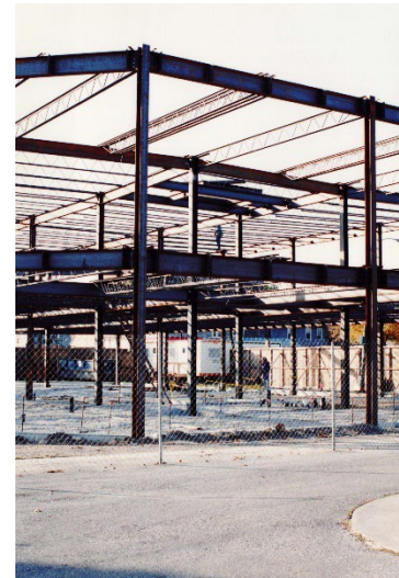
Construction at 19th and Damen for Guadalupe Reyes Children and Family Center

Main Office 1850 W. 21st Street Chicago, IL 60608 P 312.666.4511 F 312.666.6677