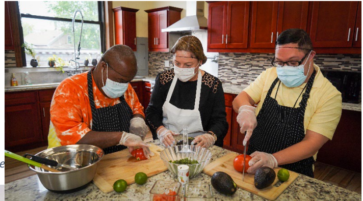
Guadalupe Reyes Children and Family Center Groundbreaking

with unique needs received early supports, while families were given additional dual-language resources not available in Illinois.