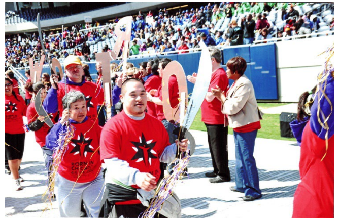
Adult Program Participants at the Special Olympic Opening Ceremony

Main Office 1850 W. 21 st Street Chicago, IL 60608 P 312.666.4511 F 312.666.6677