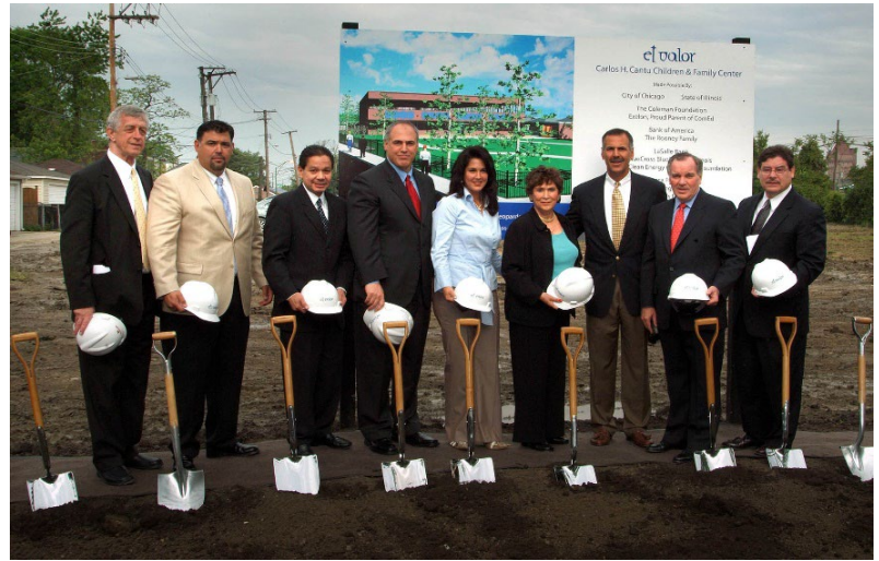
Groundbreaking for Carlos H. Cantu Children and Family Center