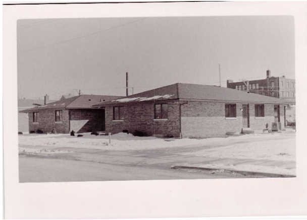
First CILA facility at El Valor