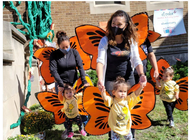
Monarch Butterfly Release at the Cicero Children and Family Center

Main Office 1850 W. 21 st Street Chicago, IL 60608 P 312.666.4511 F 312.666.6677