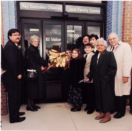
Opening of the Rey B. Gonzalez Children and Family Center