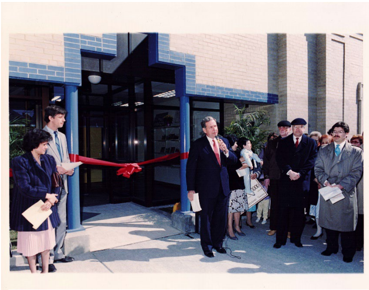
1924 W. 21st Street Early Intervention Center Opening