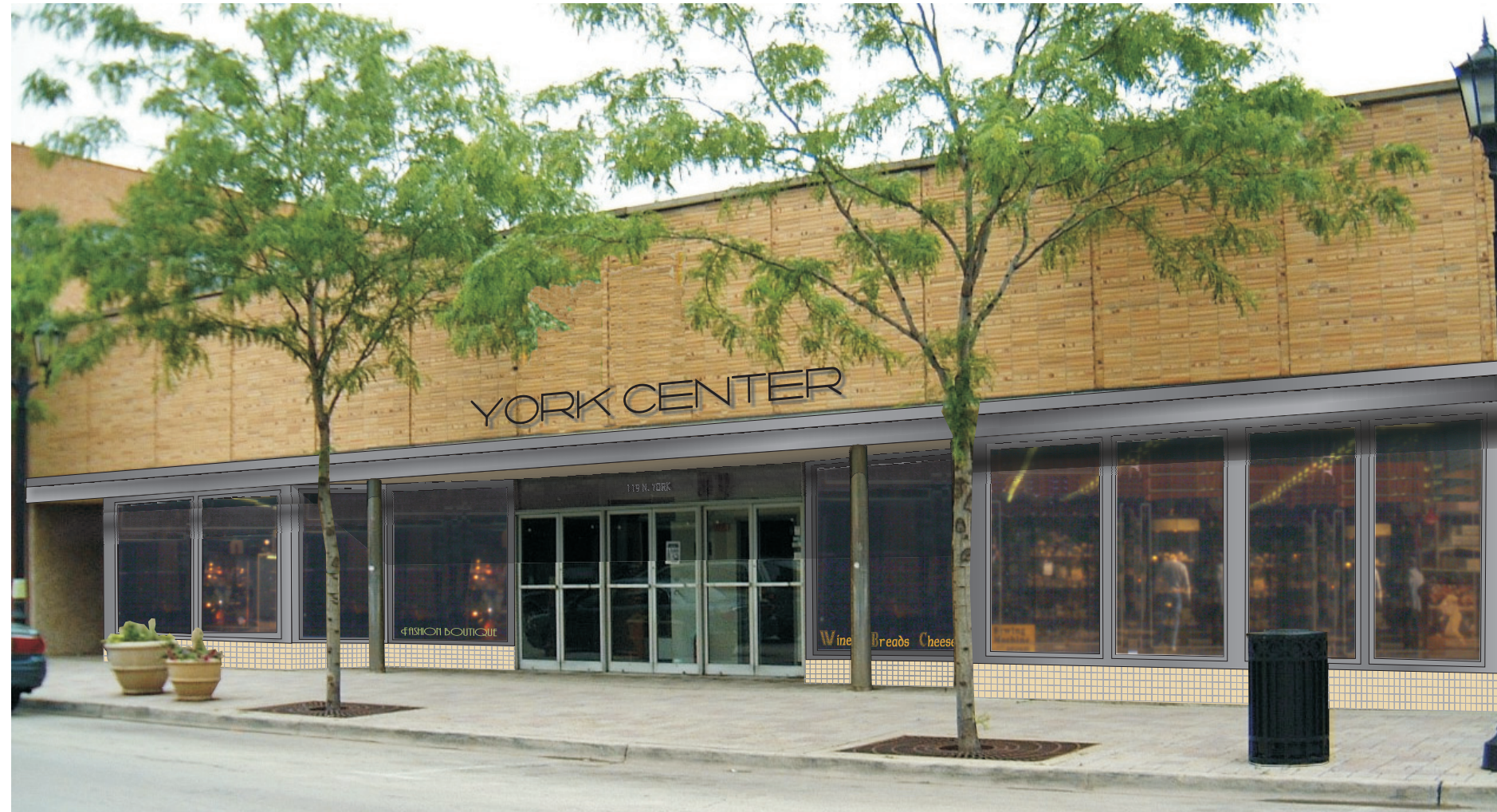
PROPOSED STOREFRONT DESIGN