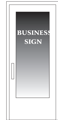
PROPOSED DOOR DESIGN WITH SIGN