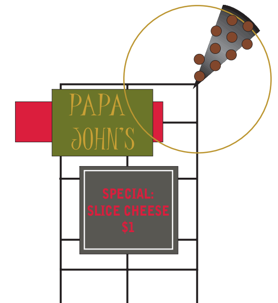
PROPOSED SIGN BOARD IN PARKING LOT

NOTE: The Illinois MAIN STREET Program, through the Illinois Historic Preservation Agency, has provided this free design assistance to qualified property/business owners in the officially designated MAIN STREET project areas. The rendering on this sheet is a conceptual view of the facade renovation based on information supplied to the staff architects. Should obscured architectural details or problems be revealed during the work, the local project manager and/or the staff architects should be consulted.