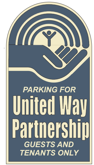
PROPOSED SIGN DESIGN PARKING LOT ENTRANCE