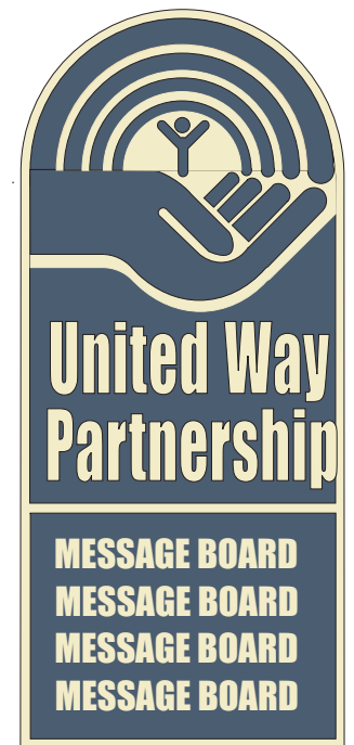
OPTIONAL SIGN DESIGN SIGN SHOWN WITH MESSAGE BOARD FOR EAST ENTRANCE OR PARKING LOT LOCATIONS