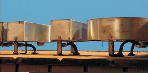
EXAMPLE OF REVERSE CHANNEL-SET NEON