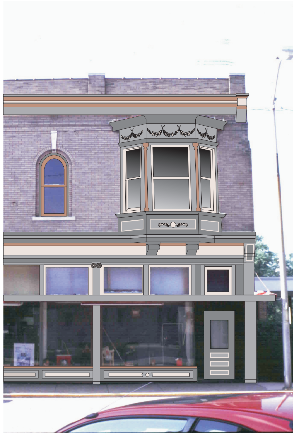
PROPOSED SCHEME 2