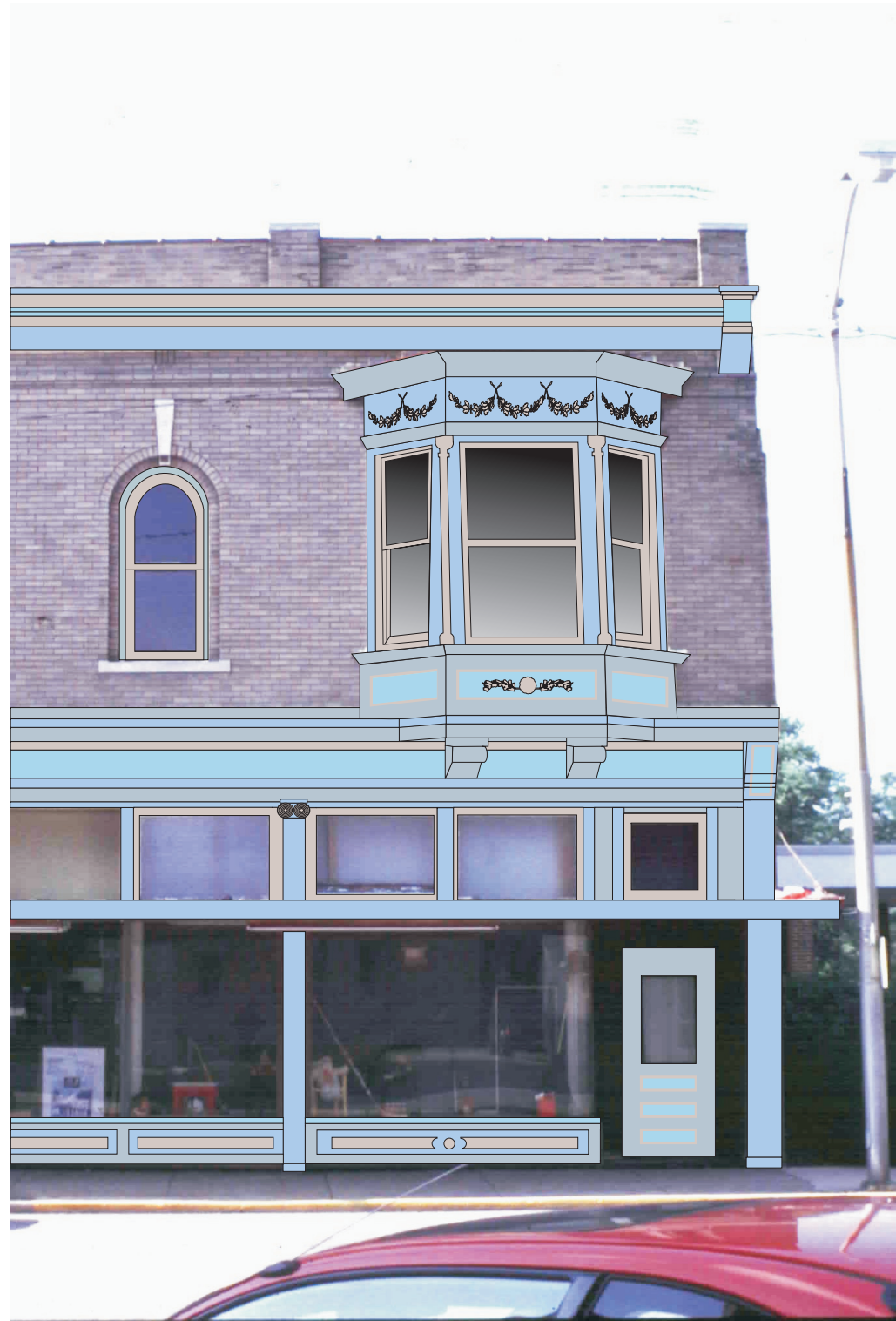
PROPOSED SCHEME 1