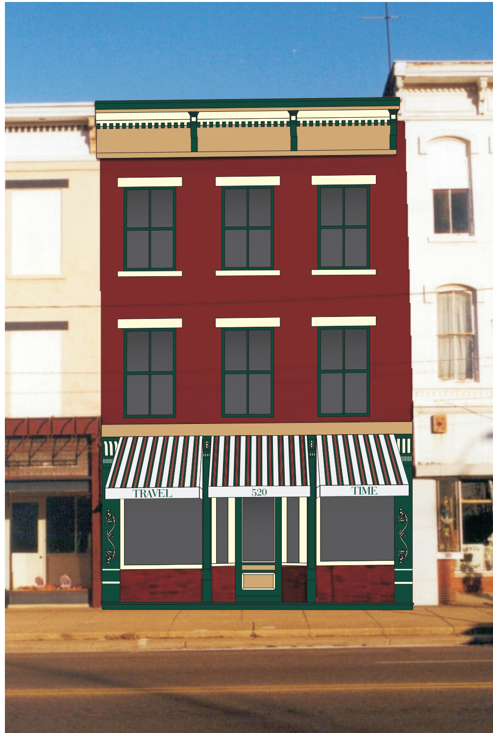
PROPOSED DESIGN WITH AWNINGS