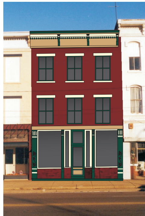
PROPOSED DESIGN WITHOUT AWNINGS