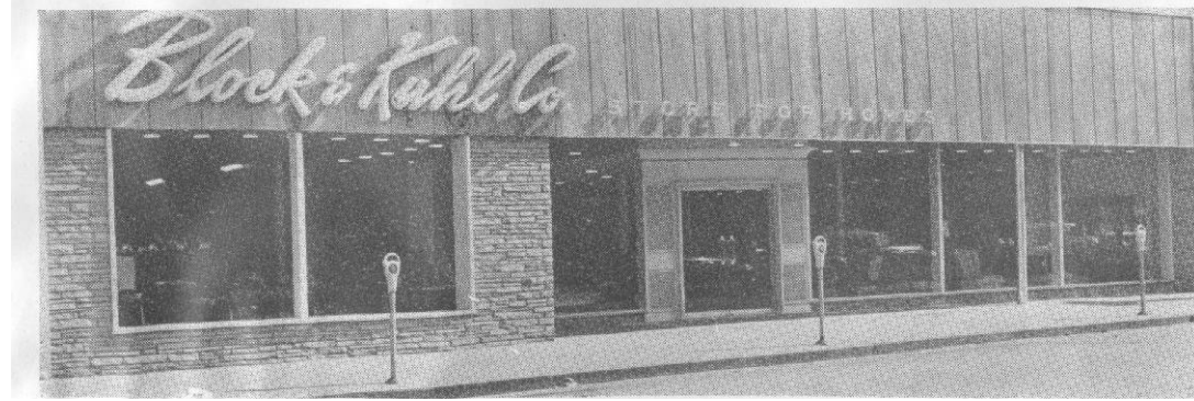
RAYMOND LOEWY STOREFRONT FURNITURE AGE, August 1948