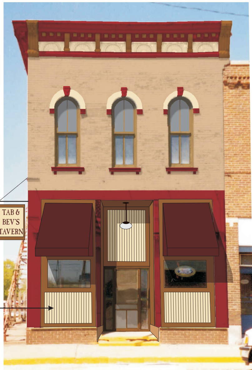
PROPOSED SCHEME A (TWO AWNINGS)

WOOD BEAD BOARD WITH 1X6 WOOD TRIM TO REPLACE EXISTING SIDING. ALL ORIGINAL PANELING IN VESTIBULE AREA TO REMAIN.