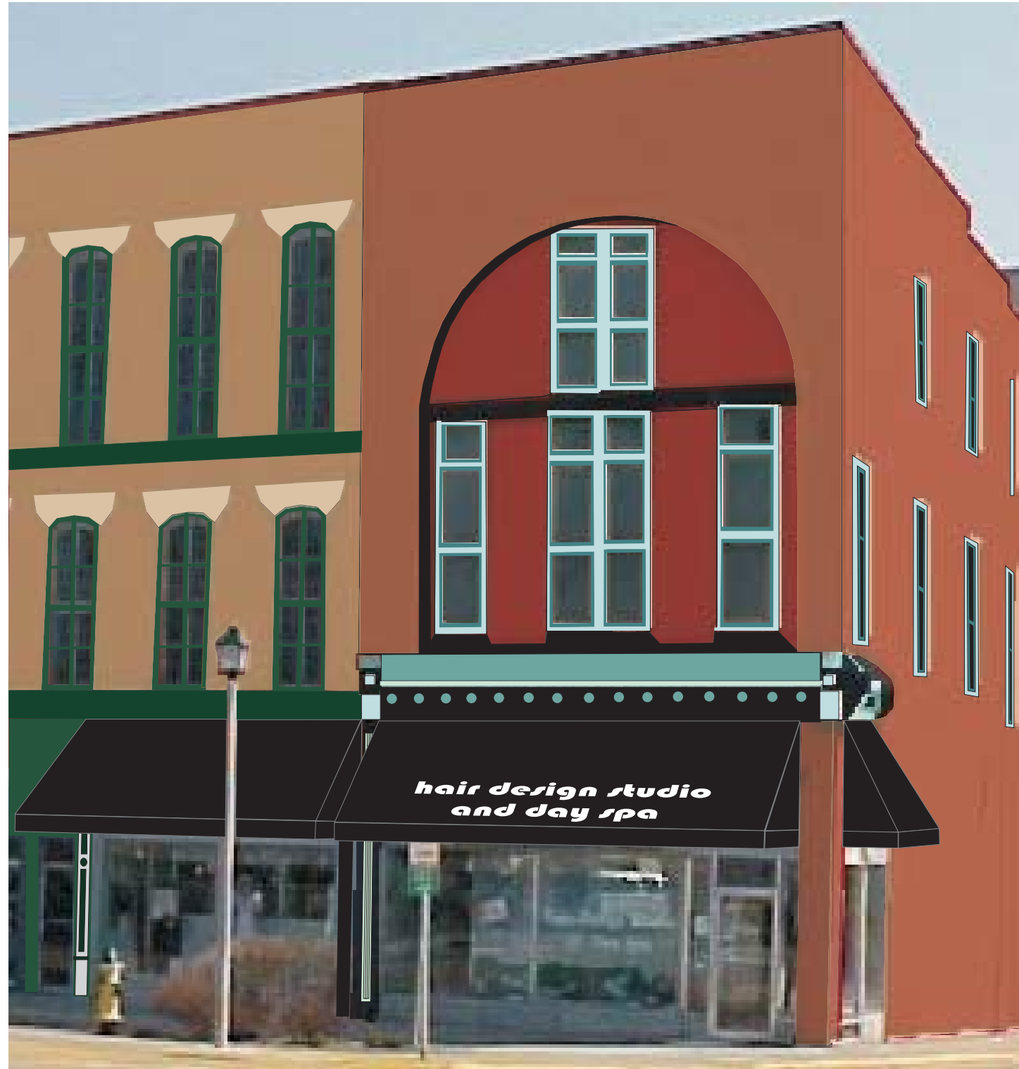
PROPOSED DESIGN FOR HAIR DESIGN STUDIO AND DAY SPA