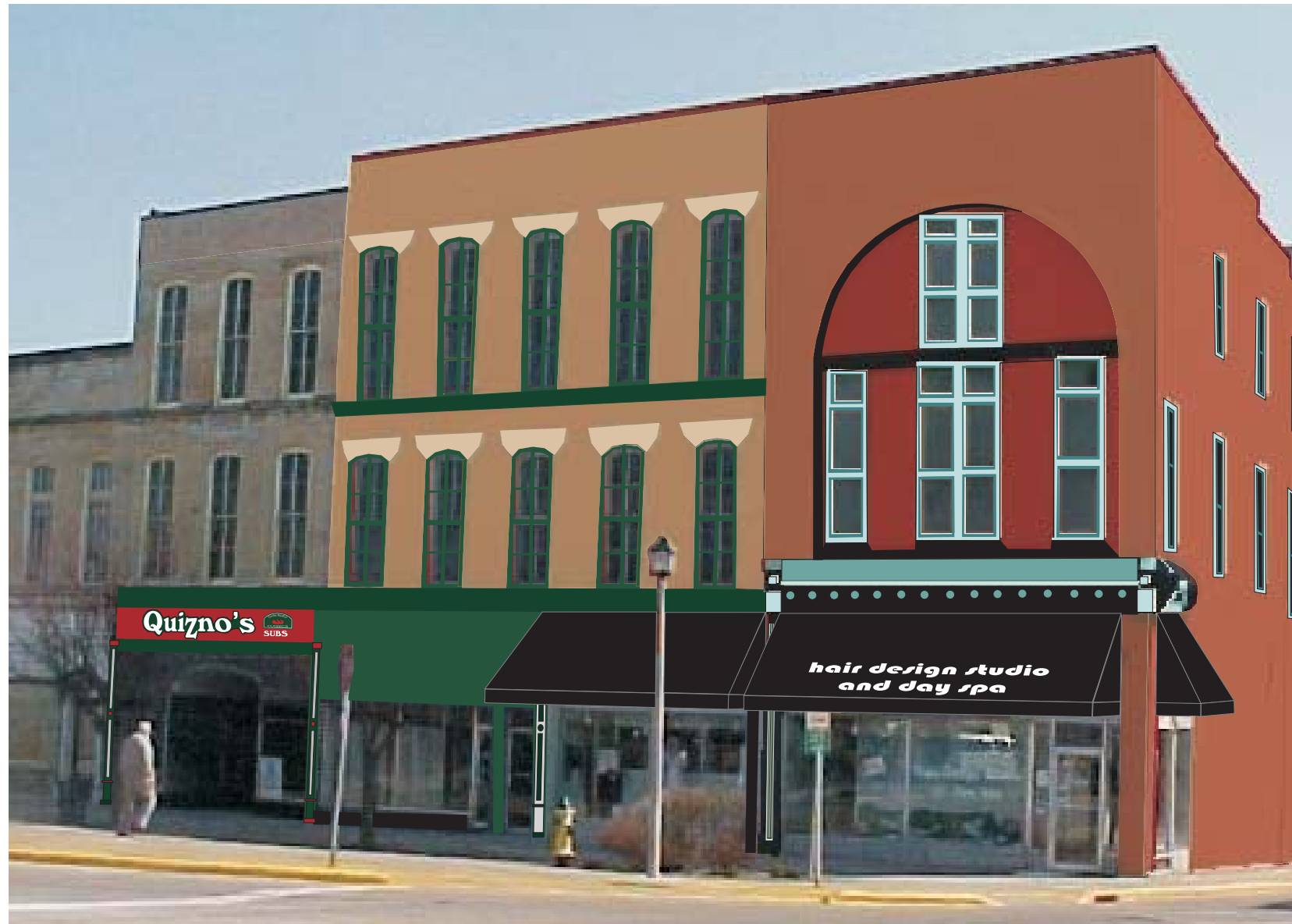
PROPOSED OVERALL DESIGN

NOTE: The Illinois Historic Preservation Agency, has provided this free design assistance to qualified property/business owners in the officially designated project areas. The rendering on this sheet is a conceptual view of the facade renovation based on information supplied to the staff architects. Should obscured architectural details or problems be revealed during the work, the local project manager and/or the staff architects should be consulted.