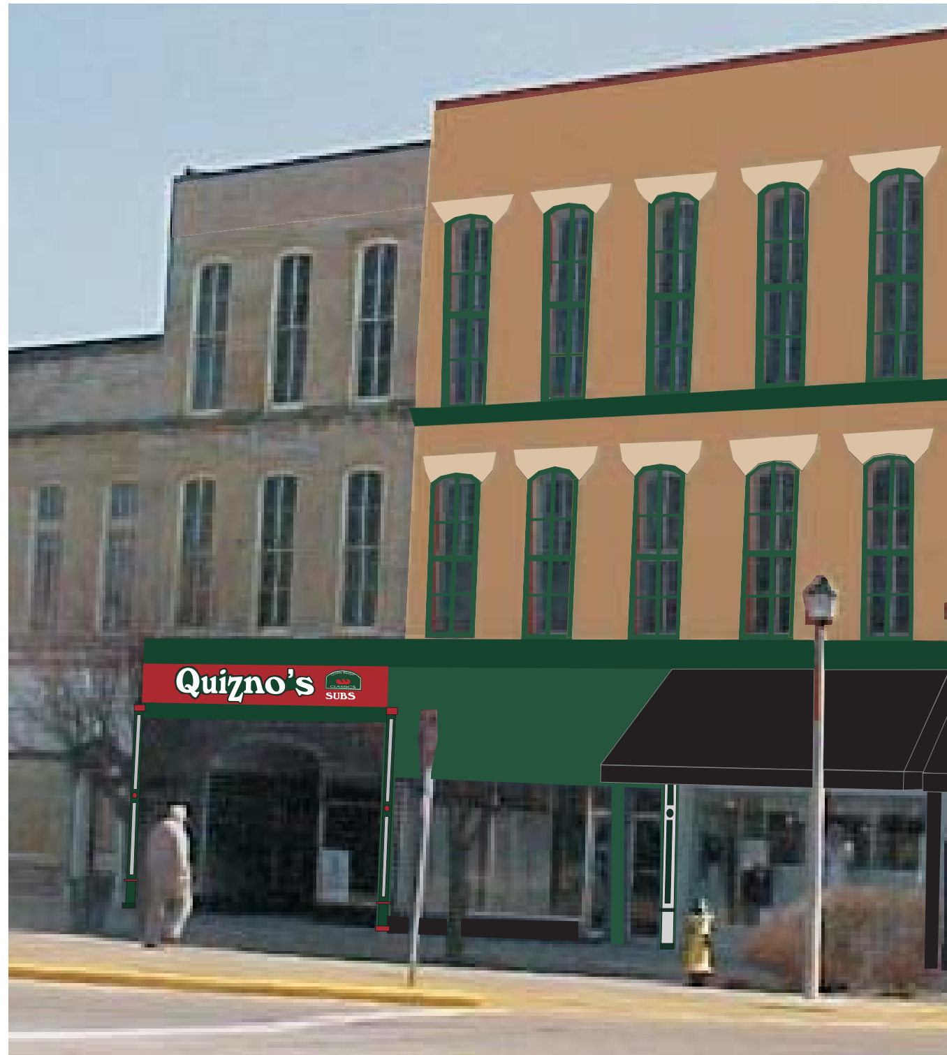
PROPOSED DESIGN FOR QUIZNO'S SUBS