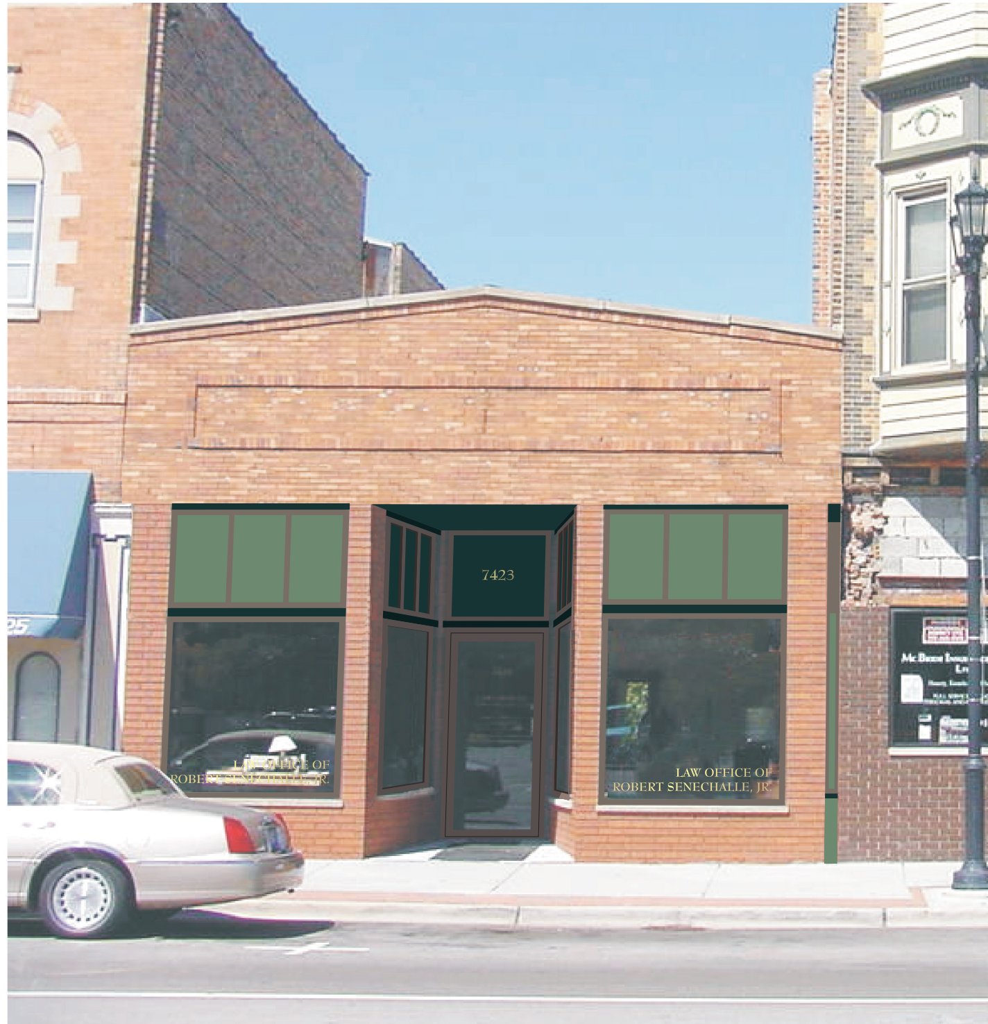
SCHEME 2 WITH TRANSOM PANELS