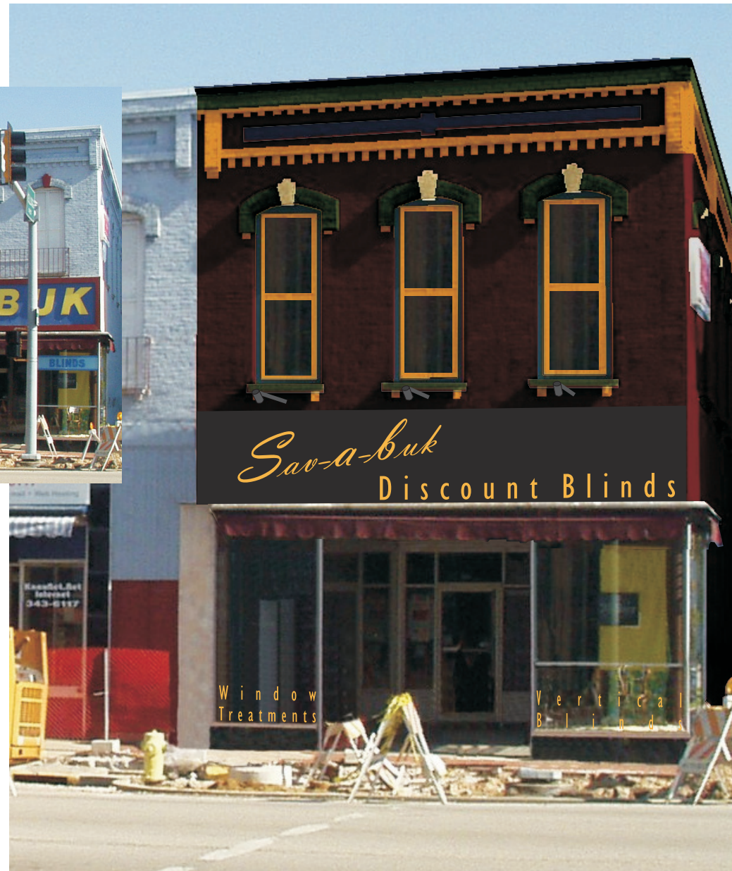
OPTION 1: SIGN DESIGN BASED ON MODERNE STYLE OF STOREFRONT