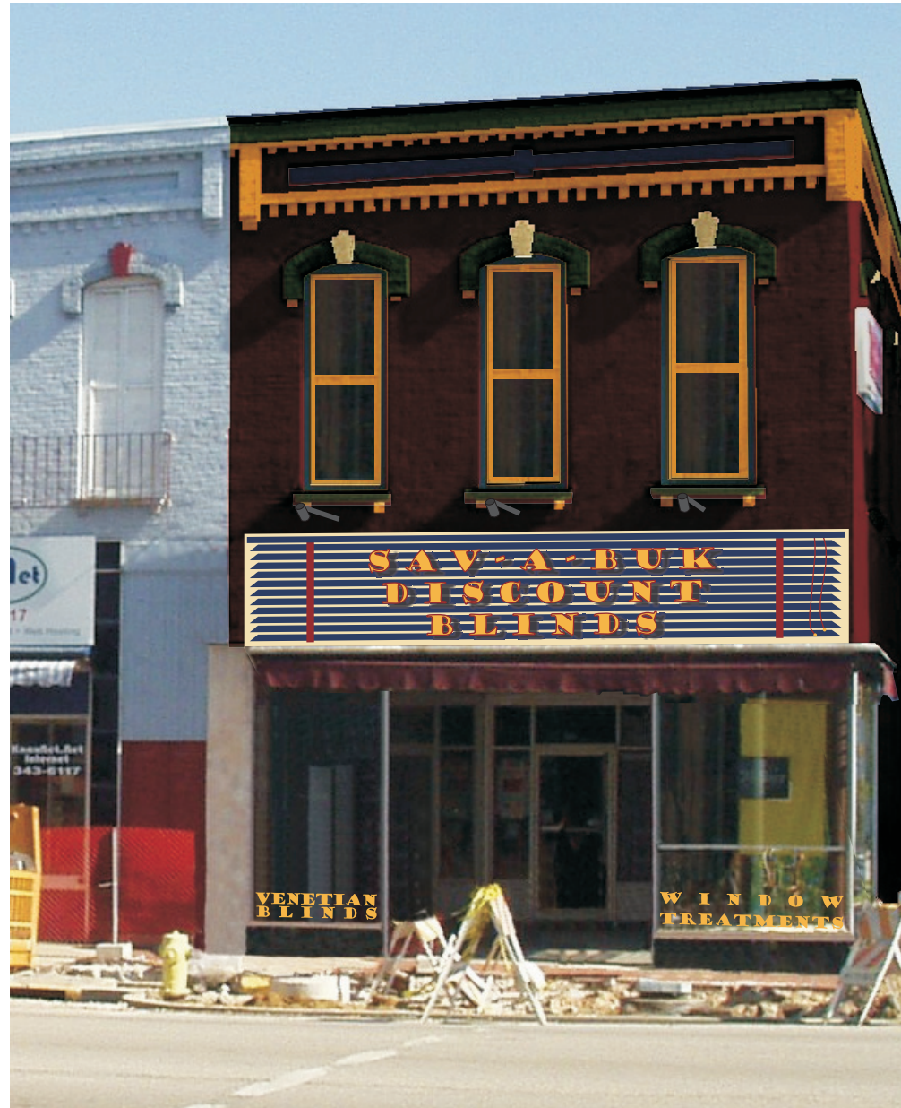
OPTION 2: SIGN DESIGN BASED ON WHIMSICAL NATURE OF COLOR SCHEME