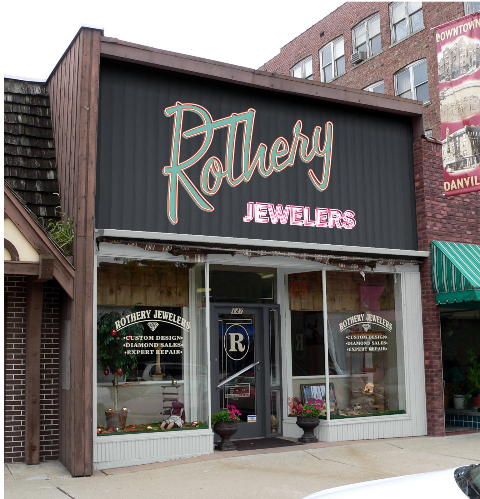
PROPOSED DESIGN OPTION 1 Neon sign with painted or enameled letters in the background