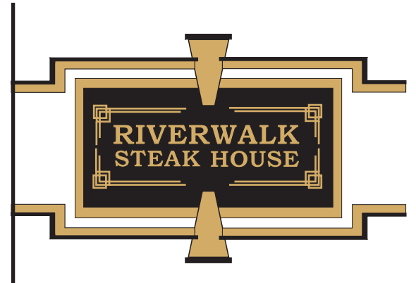
PERPENDICULAR SIGN DESIGN