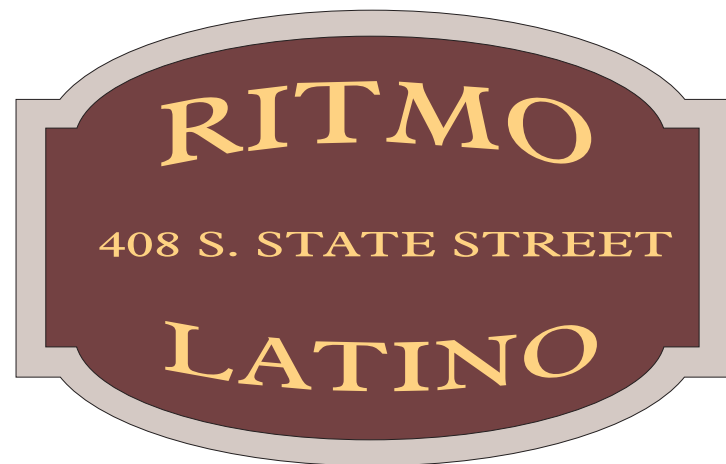
PROPOSED SIGN DESIGN