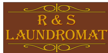
PROPOSED SIDE ELEVATION SIGN