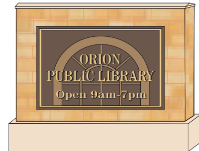
GRAPHIC 36" x 24" BRICK SIGN 48" x 32" WITH A 8" CAST STONE BASE