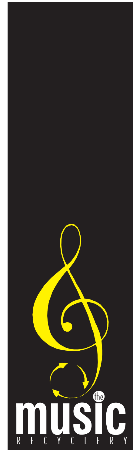
BANNER SIGN SUGGESTION