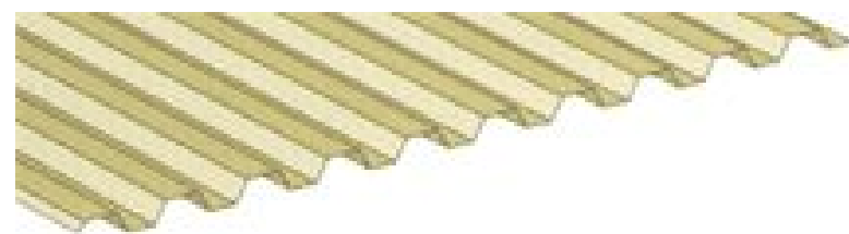
4" RIB CORRUGATED ROOFING