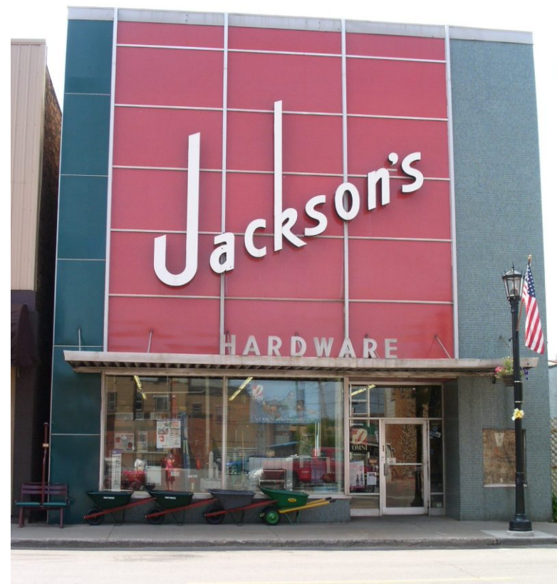
EXAMPLE OF A PORCELAIN ENAMEL FACADE

Corrugated metal canopy should have a minimal pitch. Vinyl graphics are applied directly to the porcelain enamel panels. Fonts used are LampLighter Script and RIBBON. Lighting fixtures are by B-K Lighting.