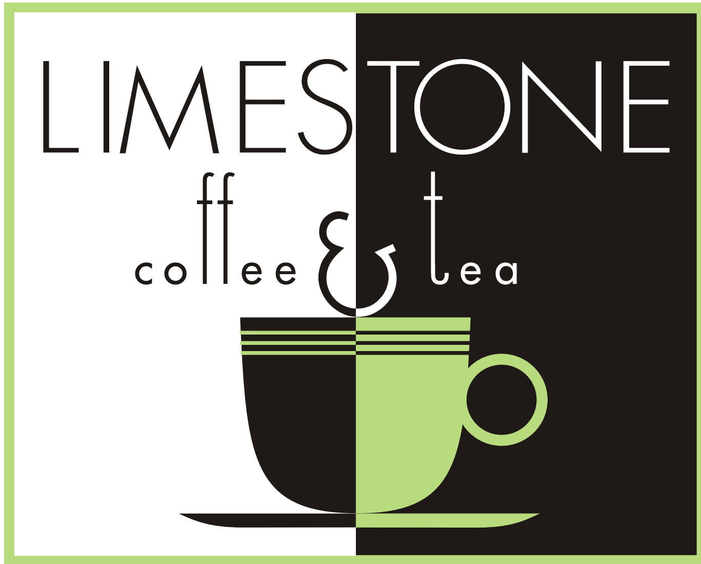
General Logo Design