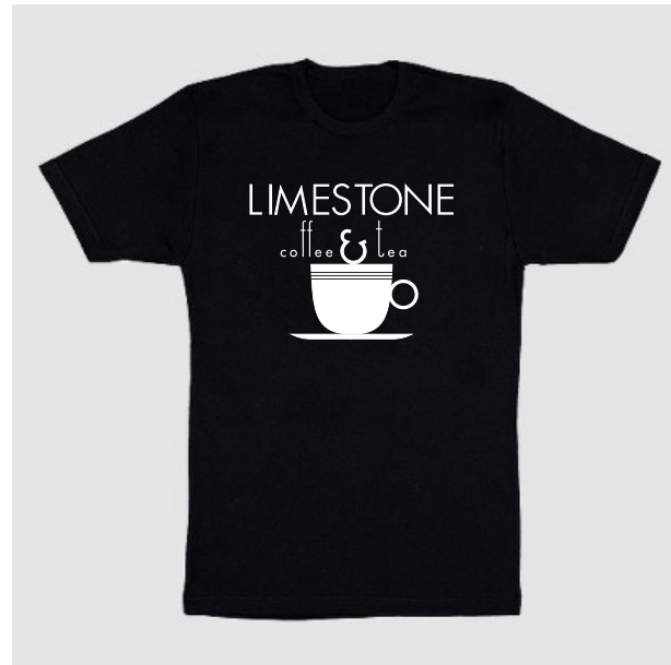
Black T-shirt with white logo