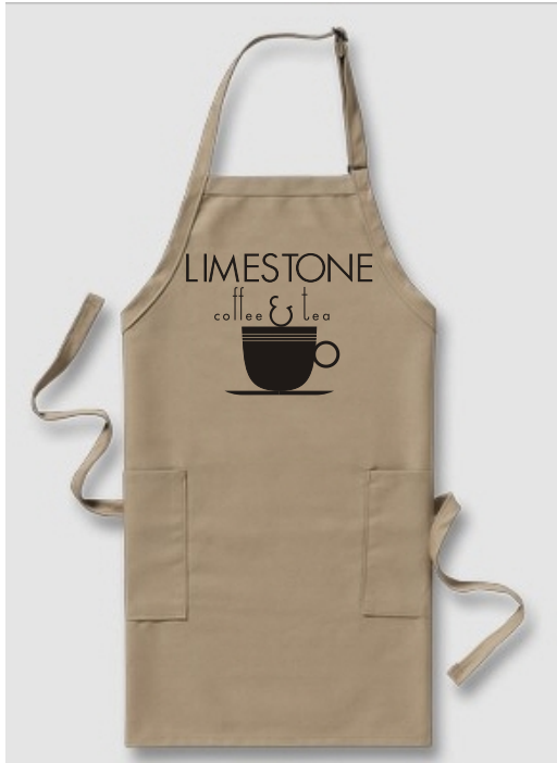
Khaki apron with black logo