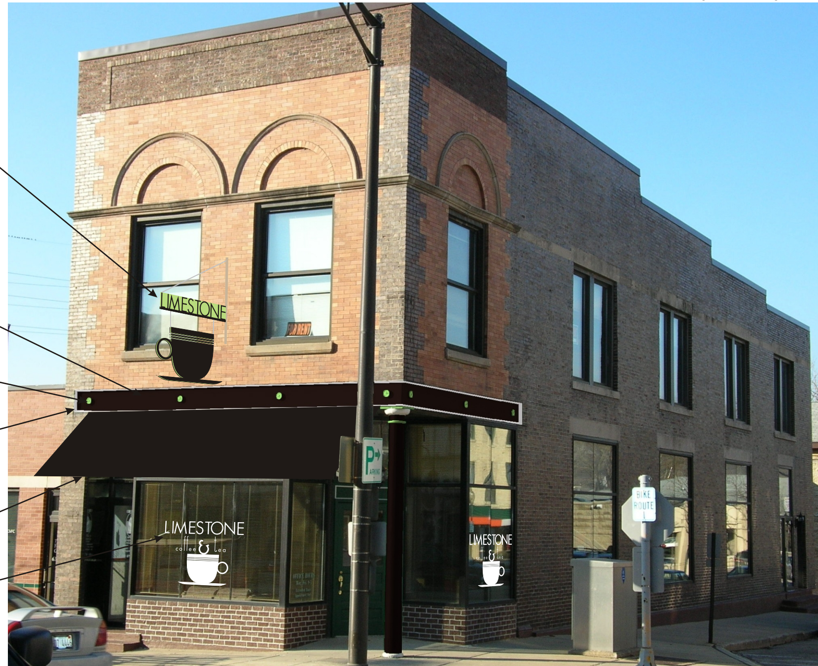
view of sign looking west