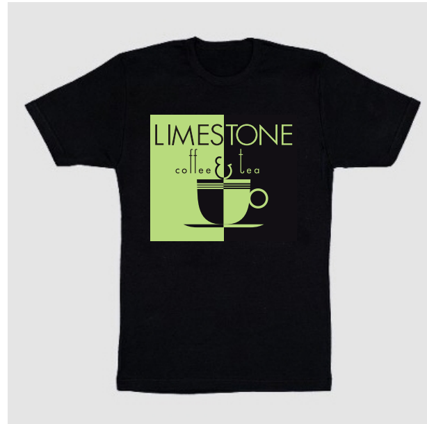
Black T-shirt with green logo