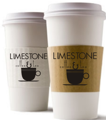
Coffee sleeves with stamped black logo