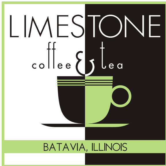
3" x3" Sticker