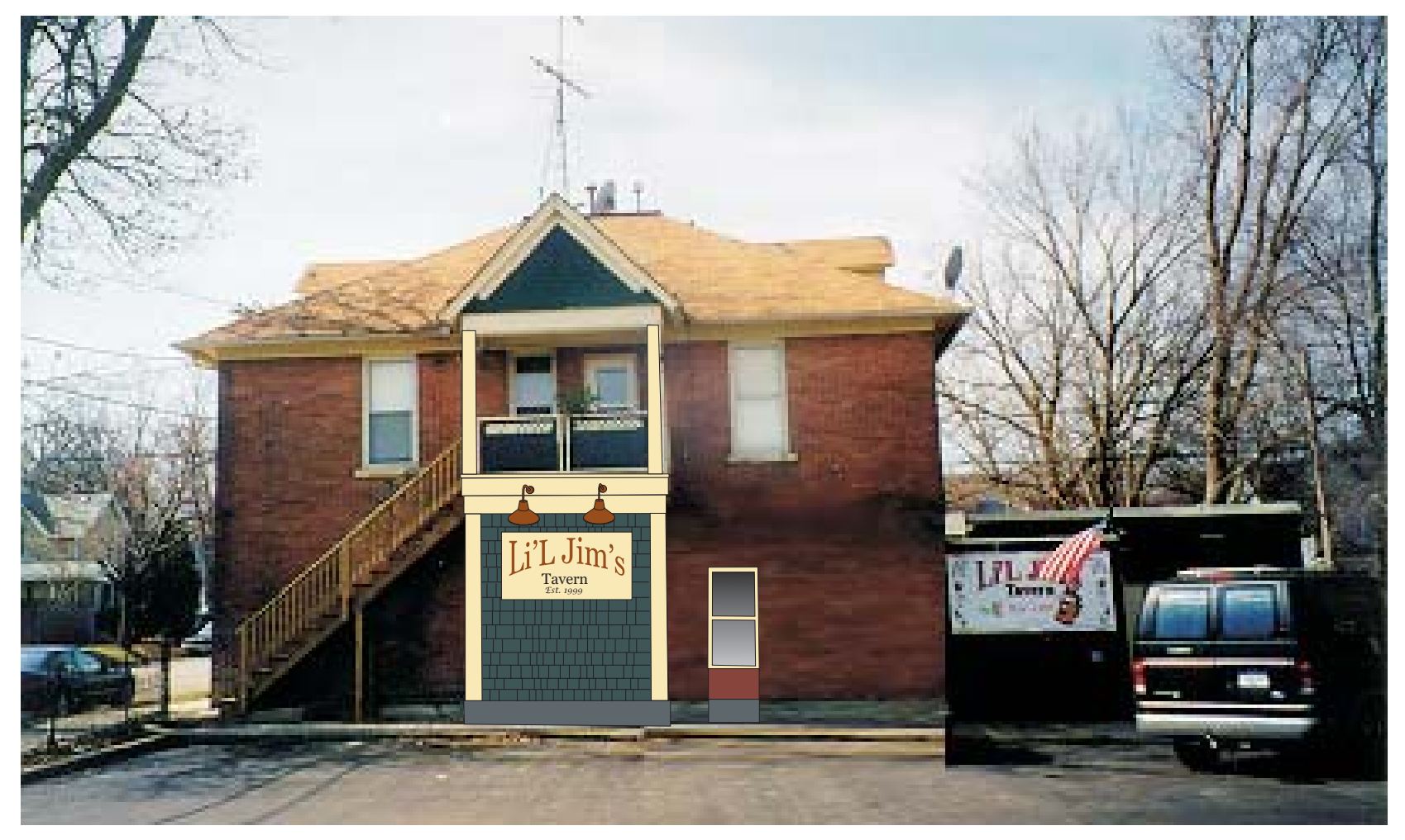
PROPOSED DESIGN - MAIN ENTRANCE