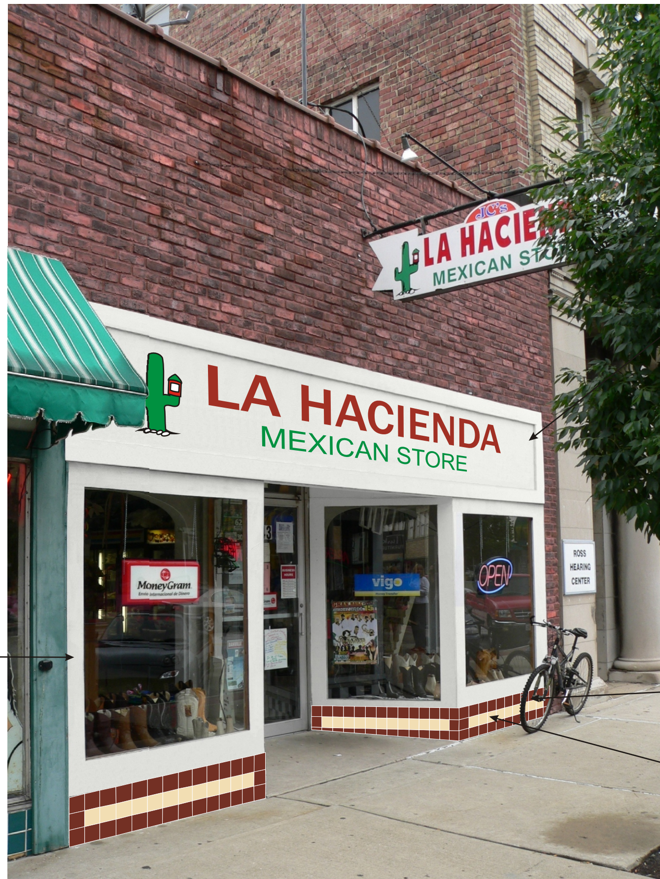
PROPOSED DESIGN 1

All woodwork should be appropriately repaired, then repainted.