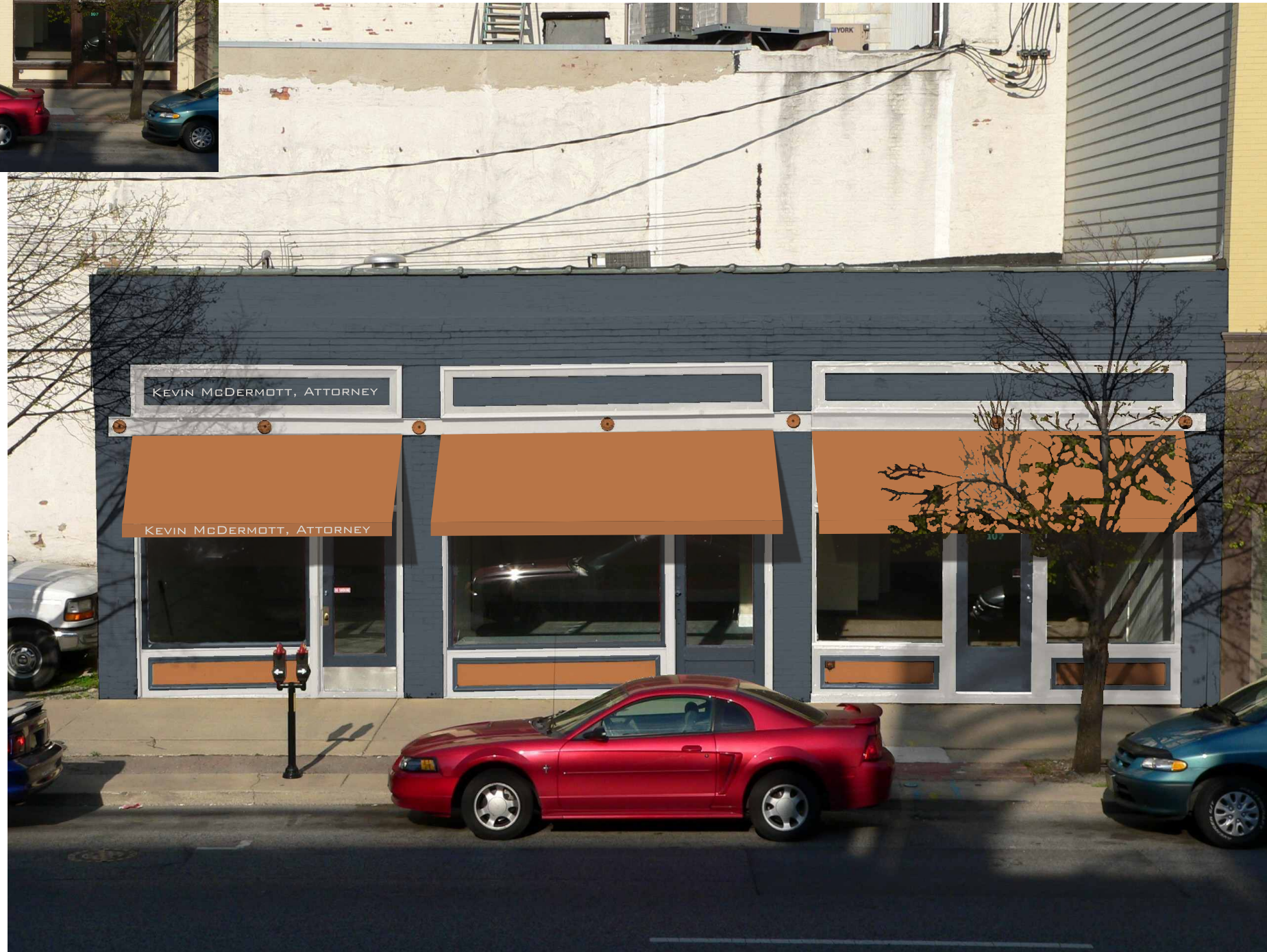
PROPOSED DESIGN Option 1