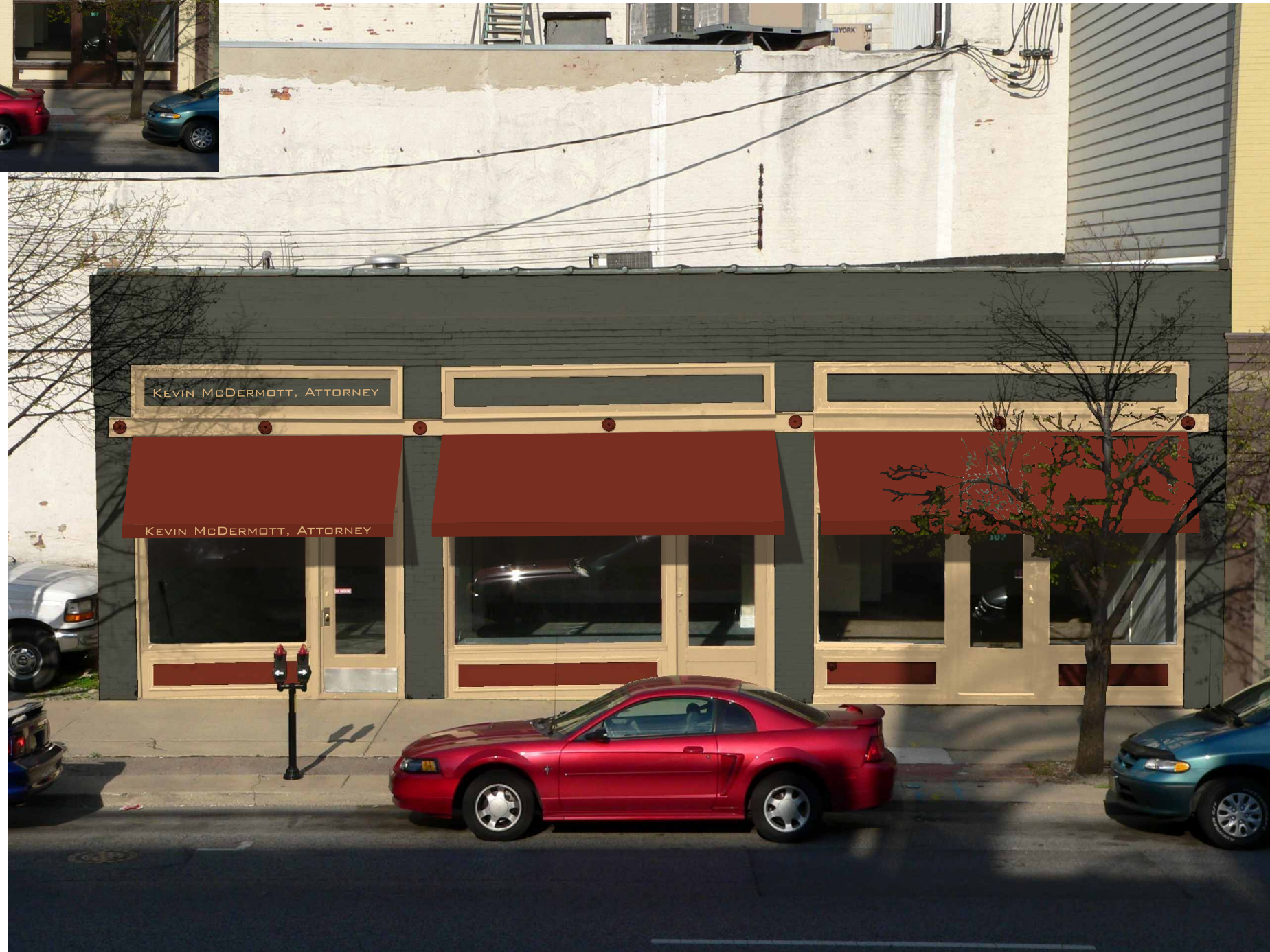
PROPOSED DESIGN Option 3