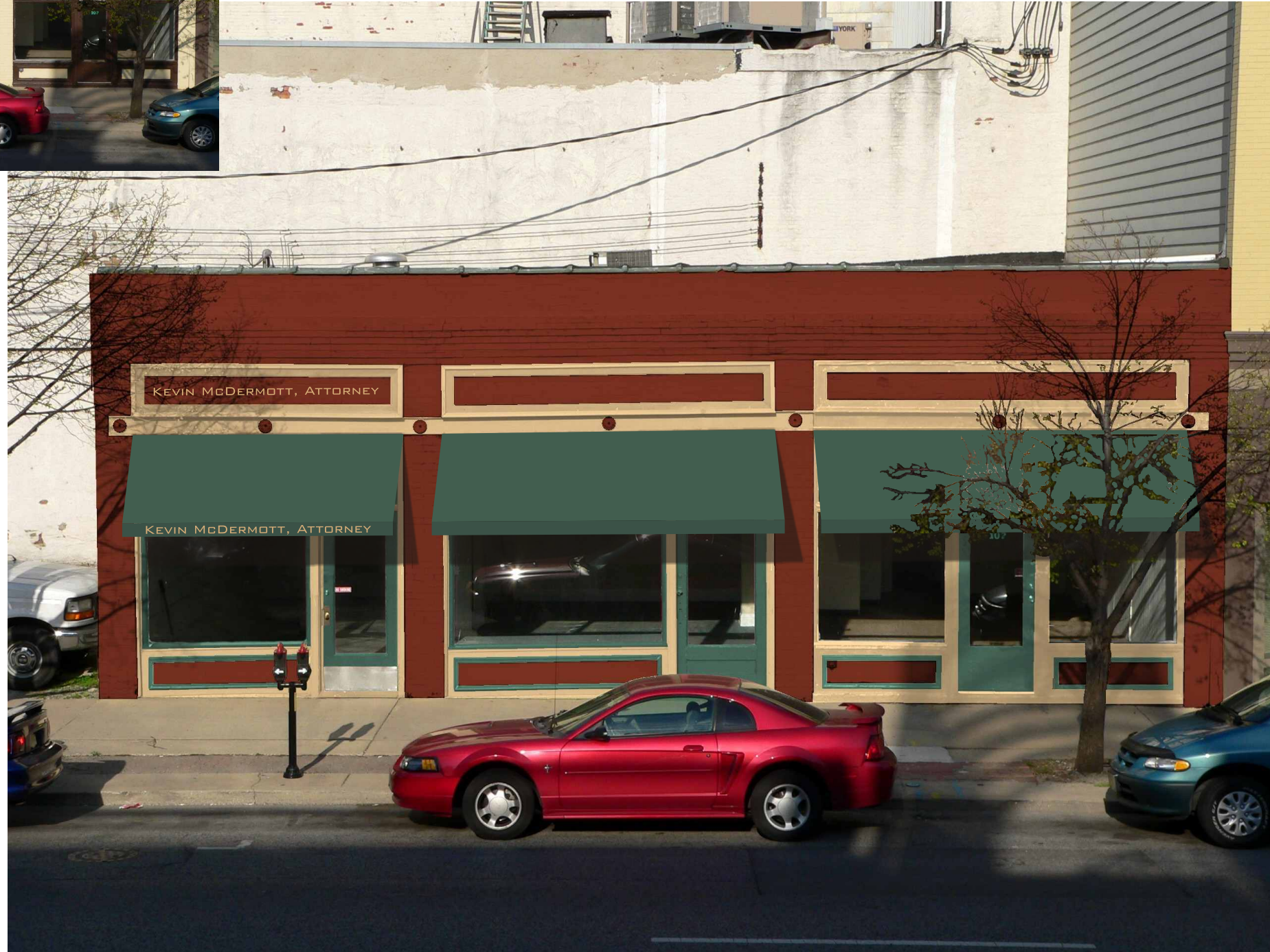
PROPOSED DESIGN Option 2