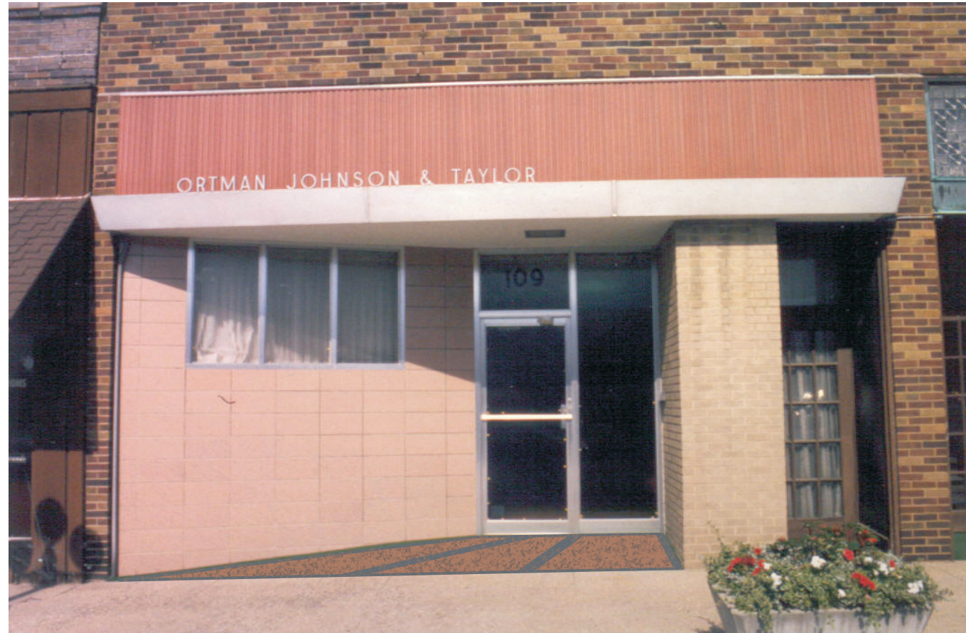
PROPOSED DESIGN - NOT TO SCALE