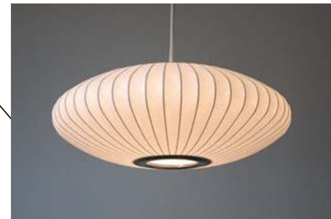
Saucer Pendant Lamp by George Nelson. Available through several retailers including Design Within Reach and Modernica.