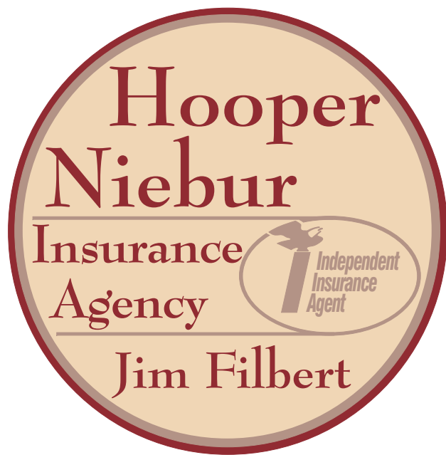
PROPOSED SIGN DESIGN