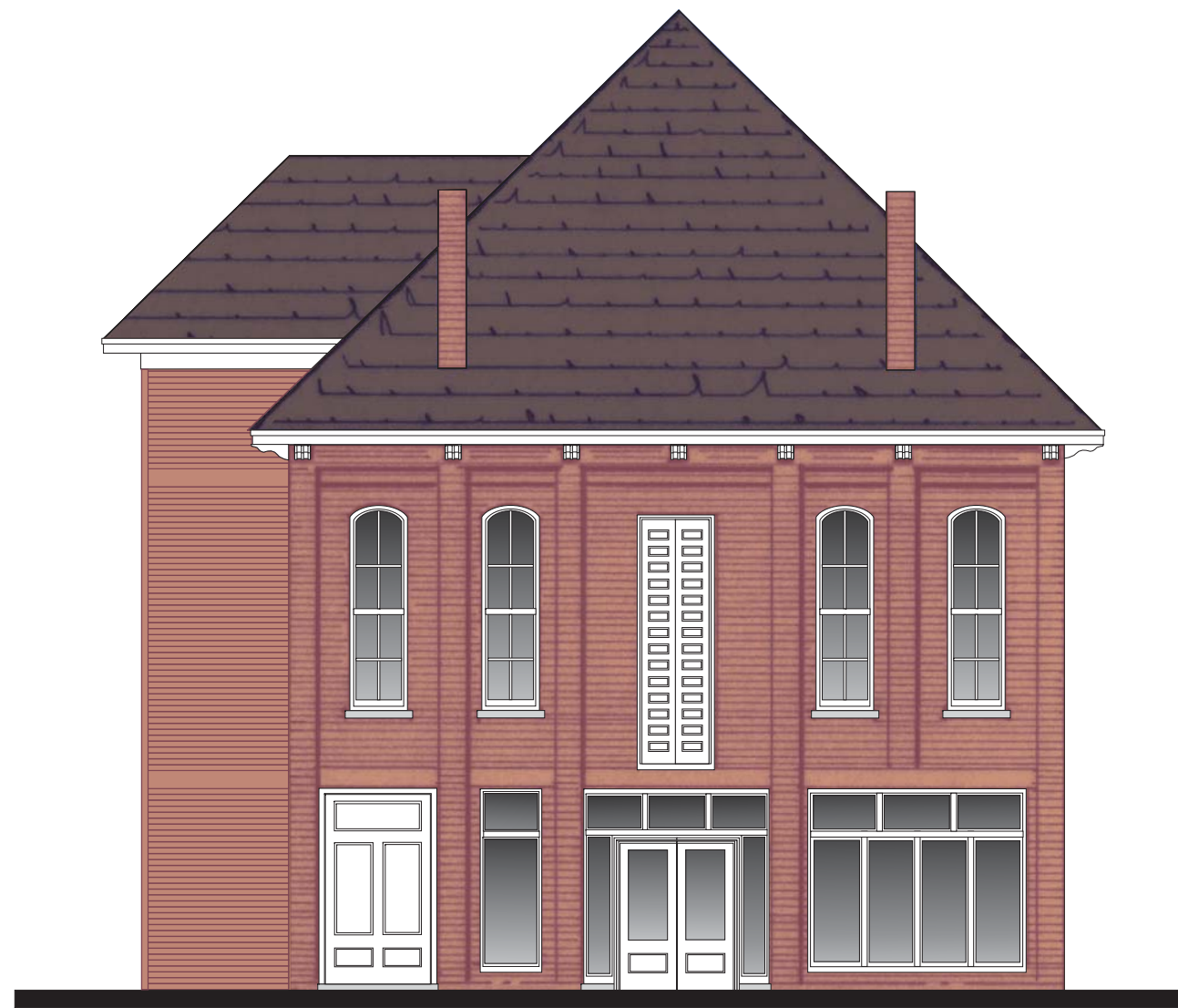
PROPOSED DESIGN WITH WOOD

NOTE: The Illinois MAIN STREET Program, through the Illinois Historic Preservation Agency, has provided this free design assistance to qualified property/business owners in the officially designated MAIN STREET project areas. The rendering on this sheet is a conceptual view of the facade renovation based on information supplied to the staff architects. Should obscured architectural details or problems be revealed during the work, the local project manager and/or the staff architects should be consulted.