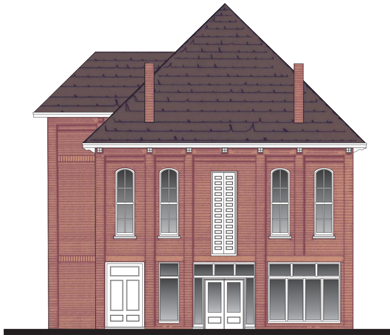
PROPOSED DESIGN WITH BRICK