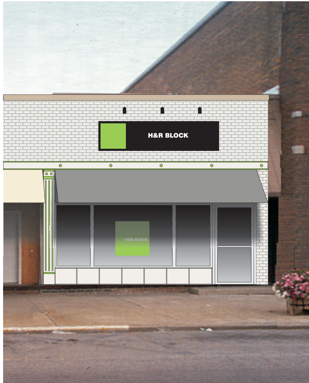
OPTION 1: "TAUPE" (#4648) AWNING AND OFF-WHITE METAL PANELS THAT MATCH THE GLAZED BRICK (NO VALANCE OR SIDE PANELS ON AWNING)