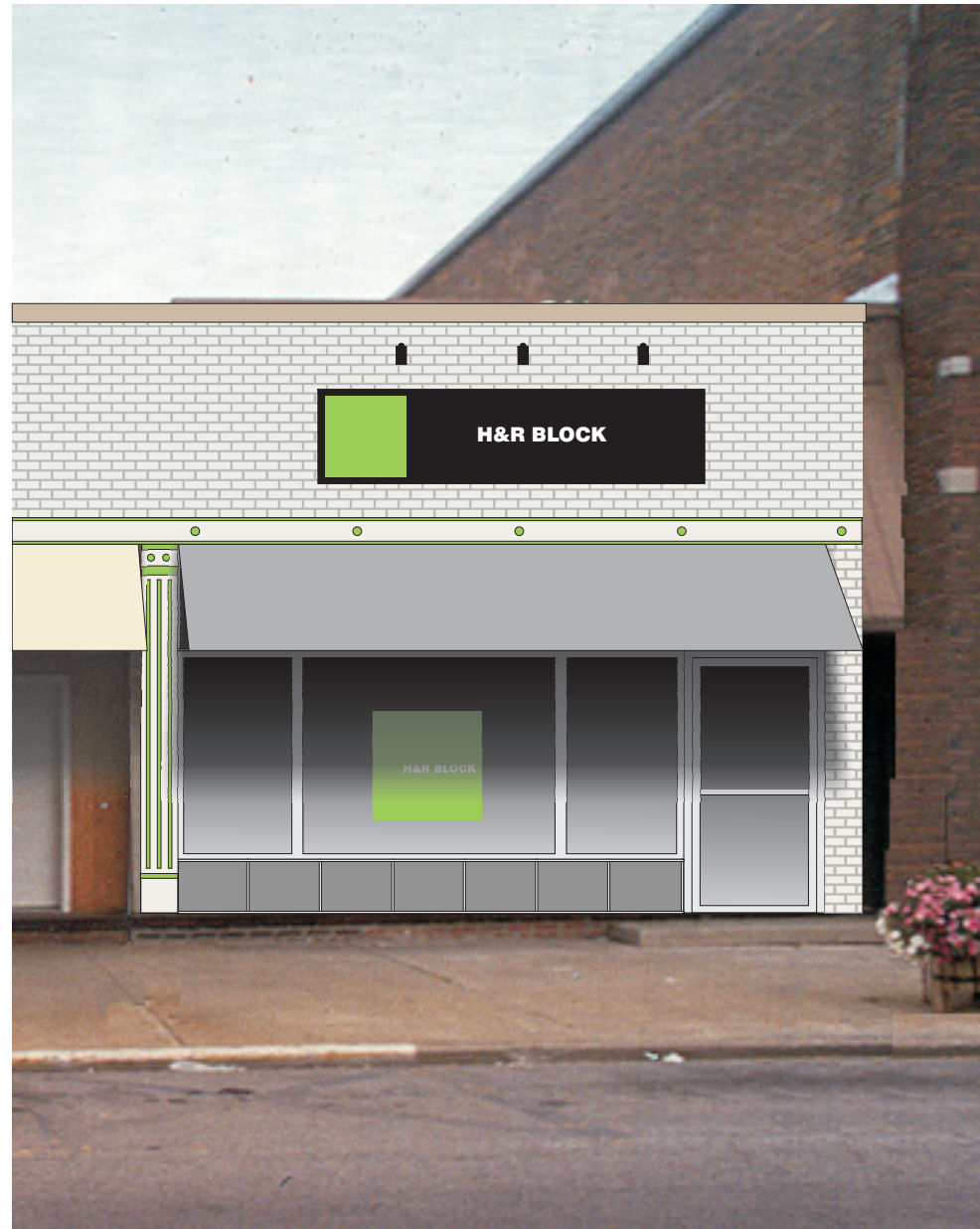
OPTION 2: "CADET GREY" (#4630) AWNING AND "SHIPYARD GRAY" METAL PANELS (NO VALANCE OR SIDE PANELS ON AWNING)