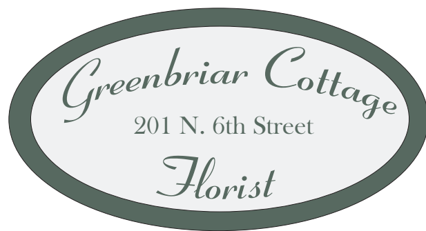
PROPOSED SIGN DESIGN