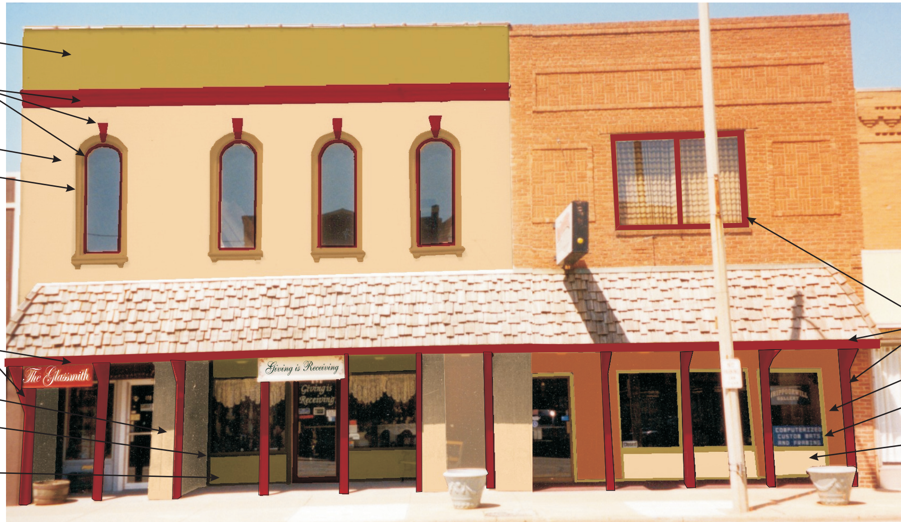
PROPOSED DESIGN FOR ENTIRE BUILDING

SUNDRIED TOMATO ROADSIDE DRIED GRASSES SUNPORCH