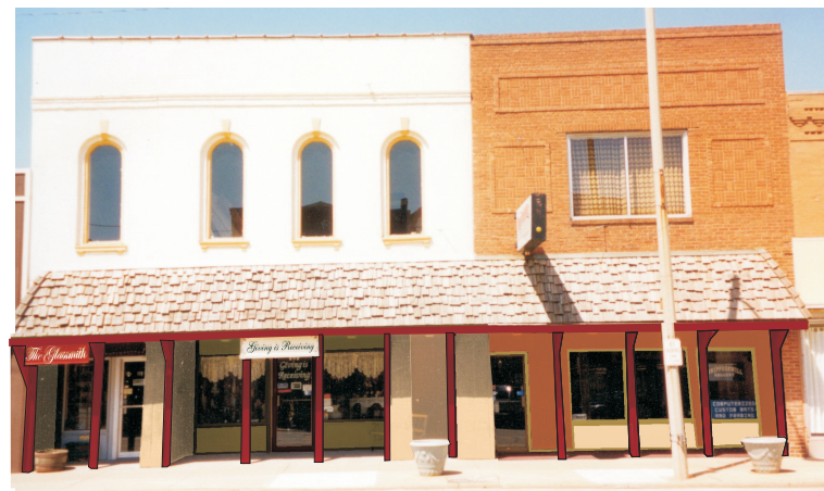
PROPOSED DESIGN- STOREFRONTS ONLY