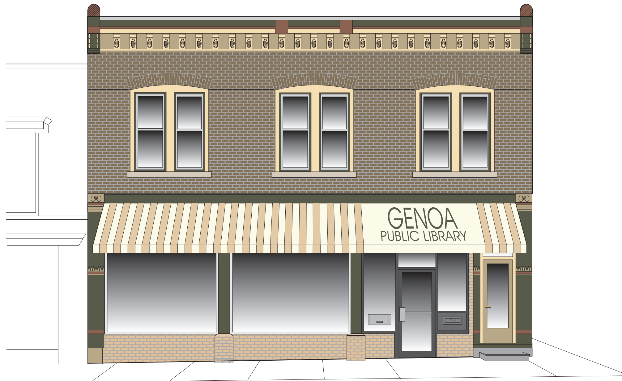
PROPOSED DESIGN SCHEME 2