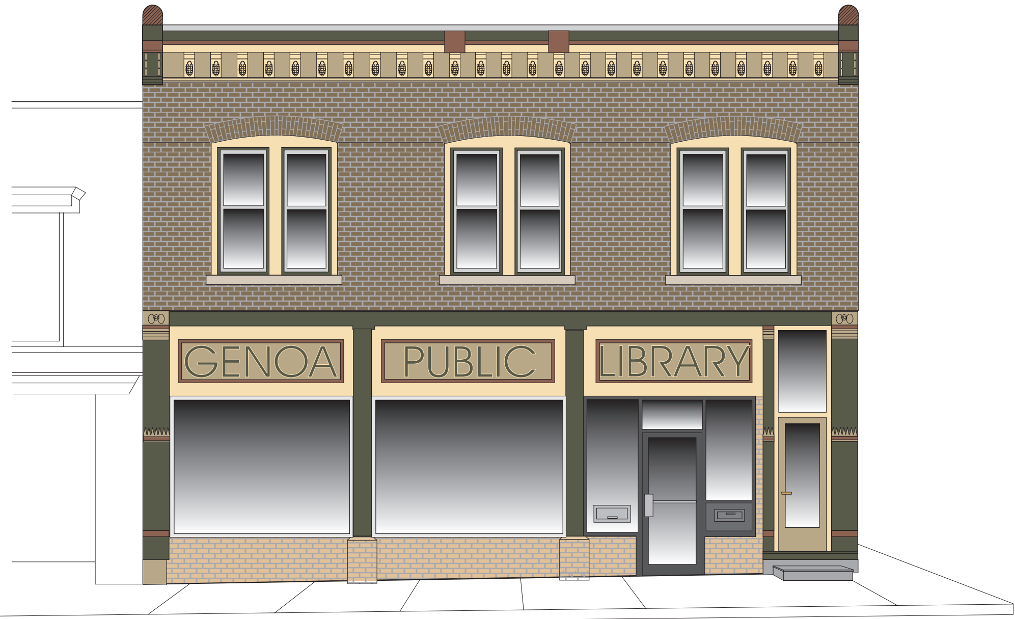
PROPOSED DESIGN SCHEME 1