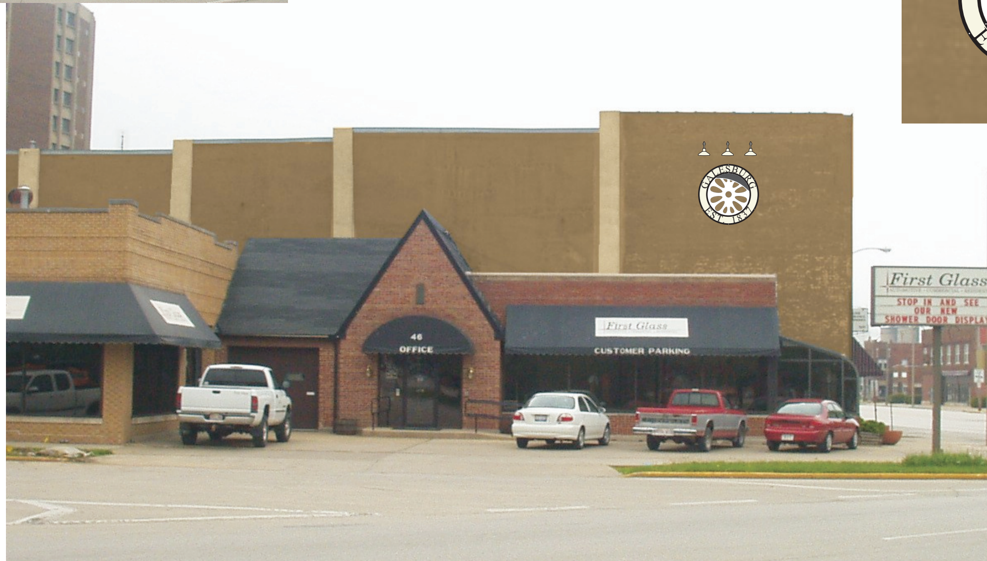
PROPOSED PAINT SCHEME 1

NOTE: The Illinois Historic Preservation Agency, has provided this free design assistance to qualified property/business owners in the officially designated project areas. The rendering on this sheet is a conceptual view of the facade renovation based on information supplied to the staff architects. Should obscured architectural details or problems be revealed during the work, the local project manager and/or the staff architects should be consulted.