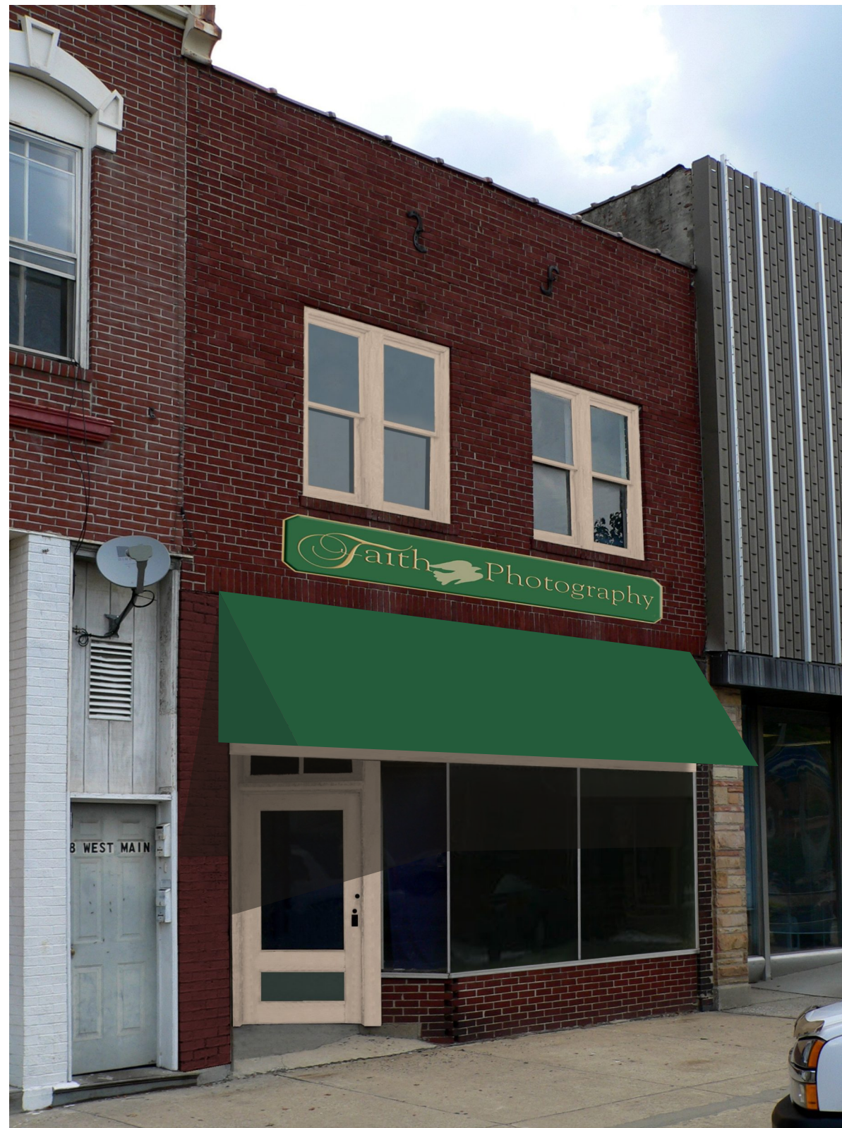
PROPOSED DESIGN FOR 6 W. MAIN