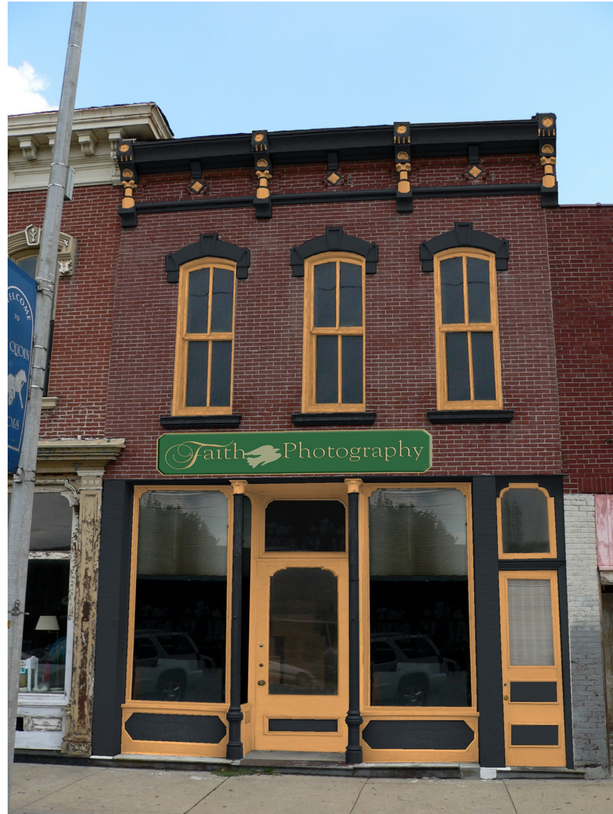
PROPOSED DESIGN FOR 8 W. MAIN