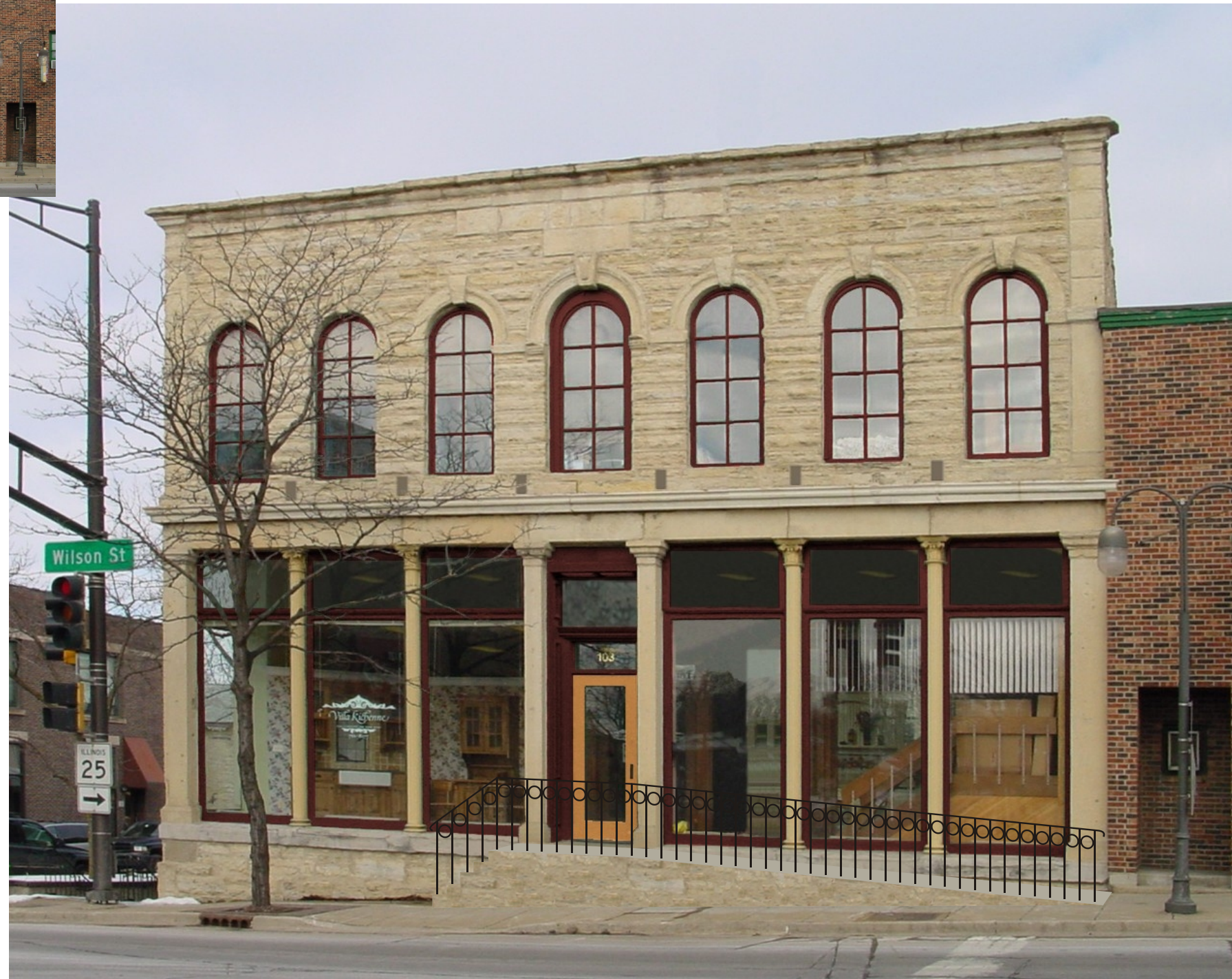
PROPOSED DESIGN Lamp post removed for drawing clarity