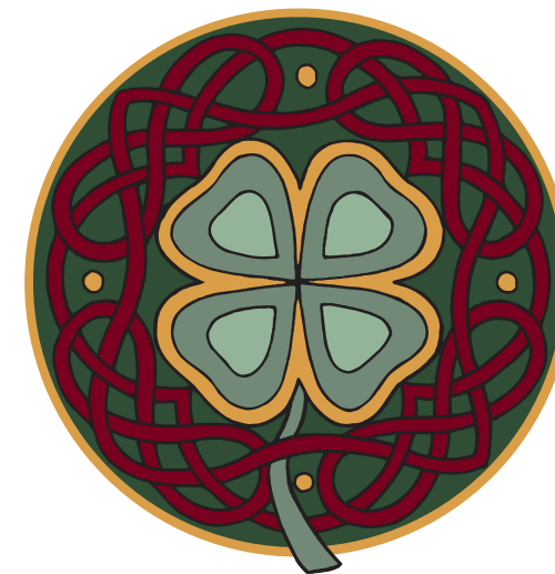
MEDALLION FOR AWNING

DETAILS: SHERWIN WILLIAMS: OLYMPIC RANGE (2385)