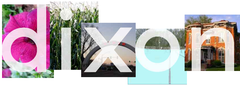
main logo with various photos