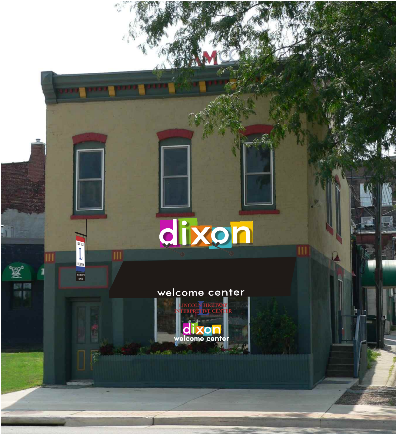
new signs and awning