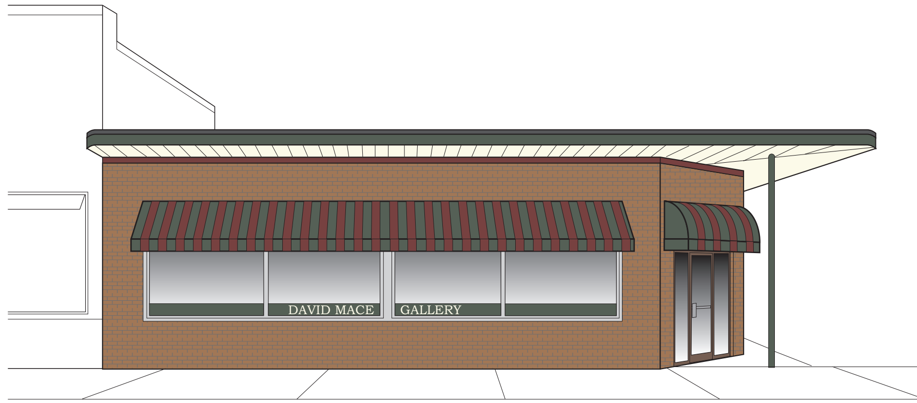
PROPOSED DESIGN 1