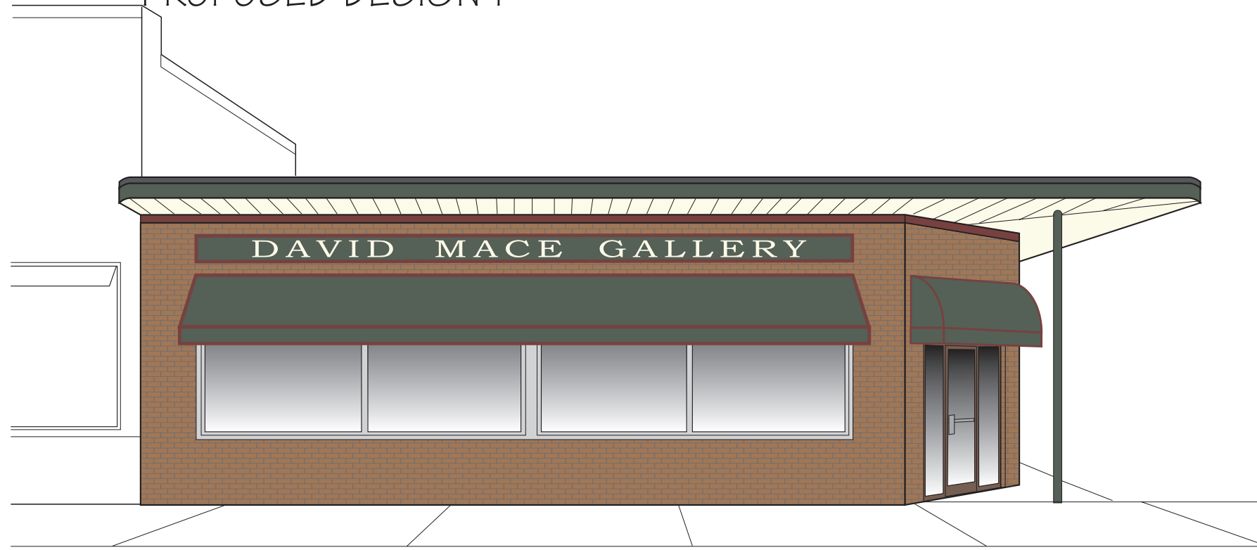
PROPOSED DESIGN 2