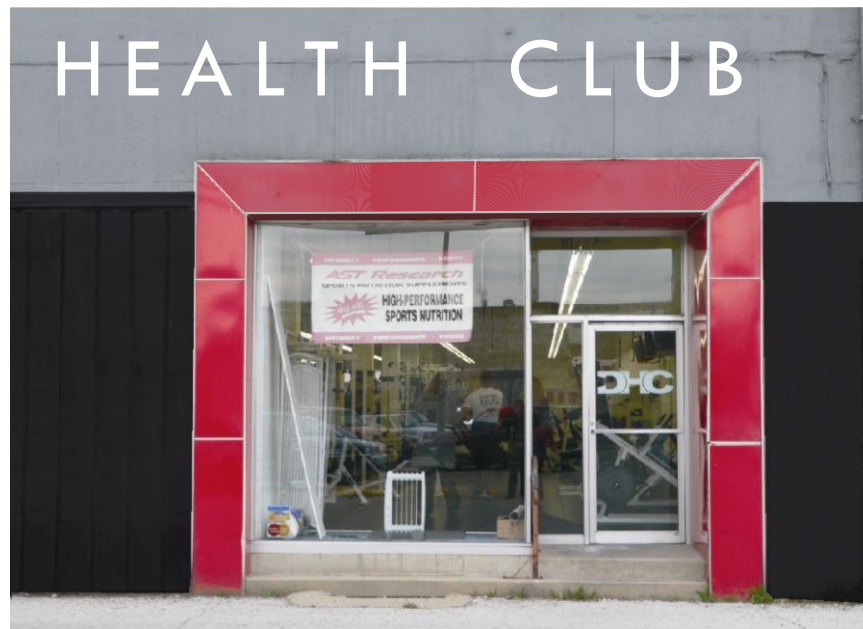
DETAIL OF STOREFRONT