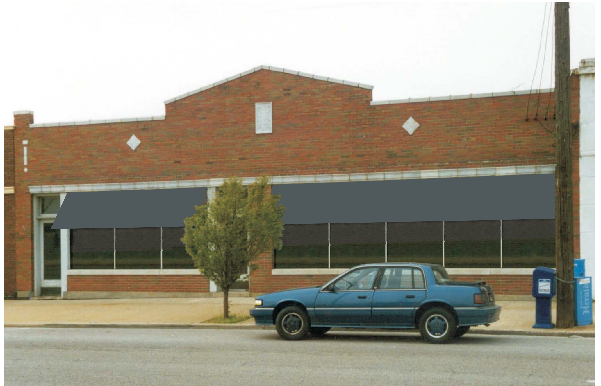
PROPOSED DESIGN Awnings by Sunbrella: Captain Navy (4646)