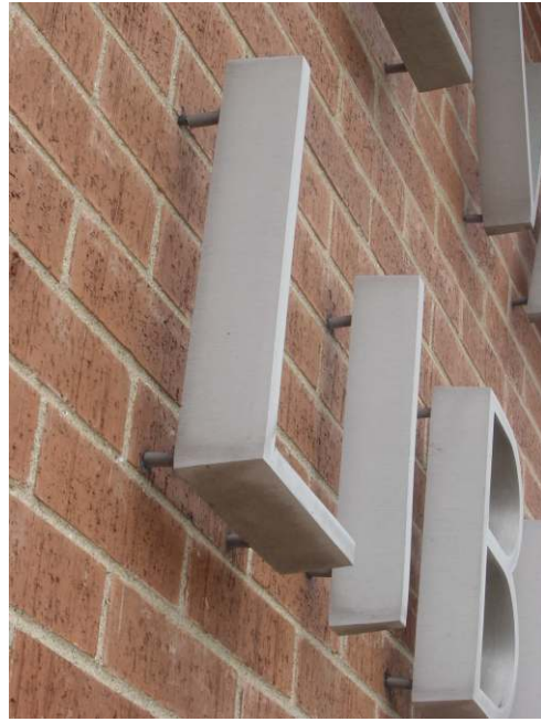
EXAMPLES OF PROPOSED SIGNS (Top and left): Individual cast metal letters (Bottom left): Metal plaques with raised letters can be utilized for displaying the doctors' names.