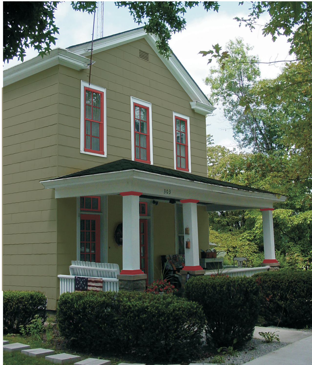
PROPOSED PAINT SCHEME