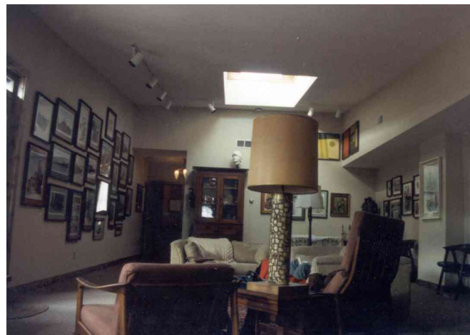
Owners' living room after rehabilitation