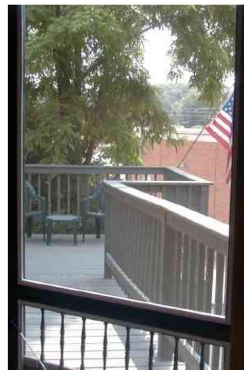
New deck off of guest suite

← Crawford Building Owners' apartment Rowley Building Guest suite →