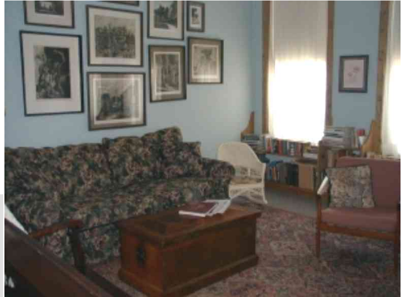
New living room in guest suite