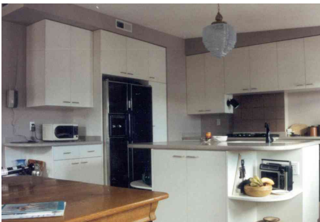
Owners' kitchen after rehabilitation