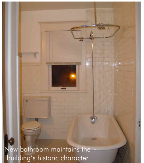
New bathroom maintains the building's historic character