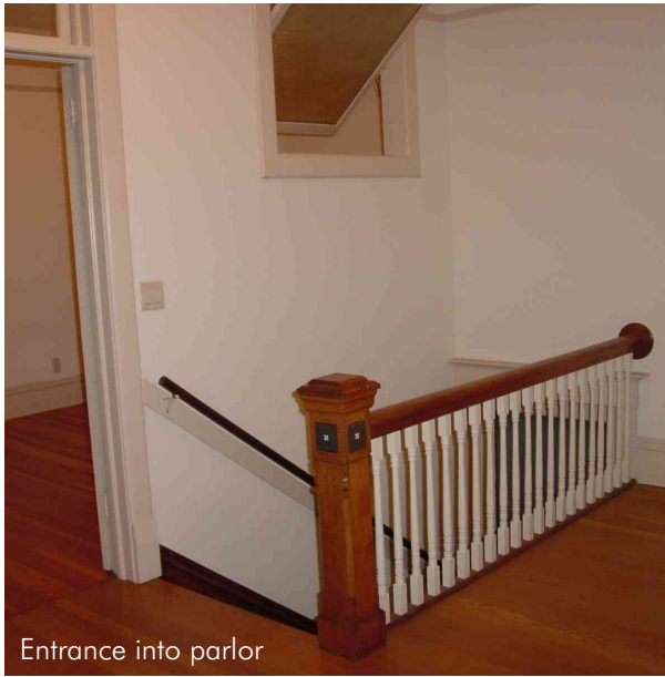
Entrance into parlor