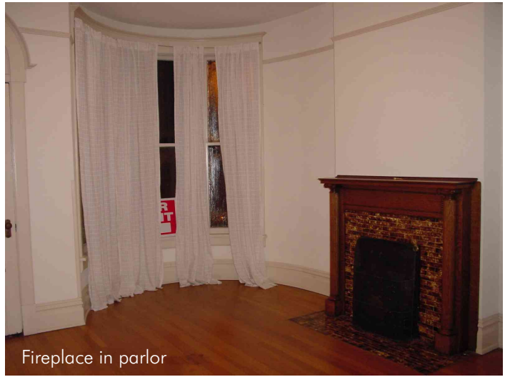
Fireplace in parlor