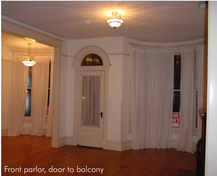
Front parlor, door to balcony