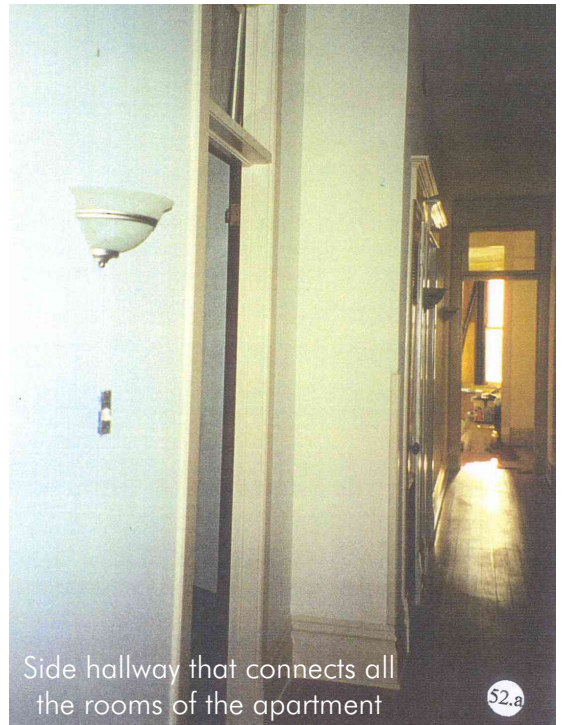
Side hallway that connects all the rooms of the apartment